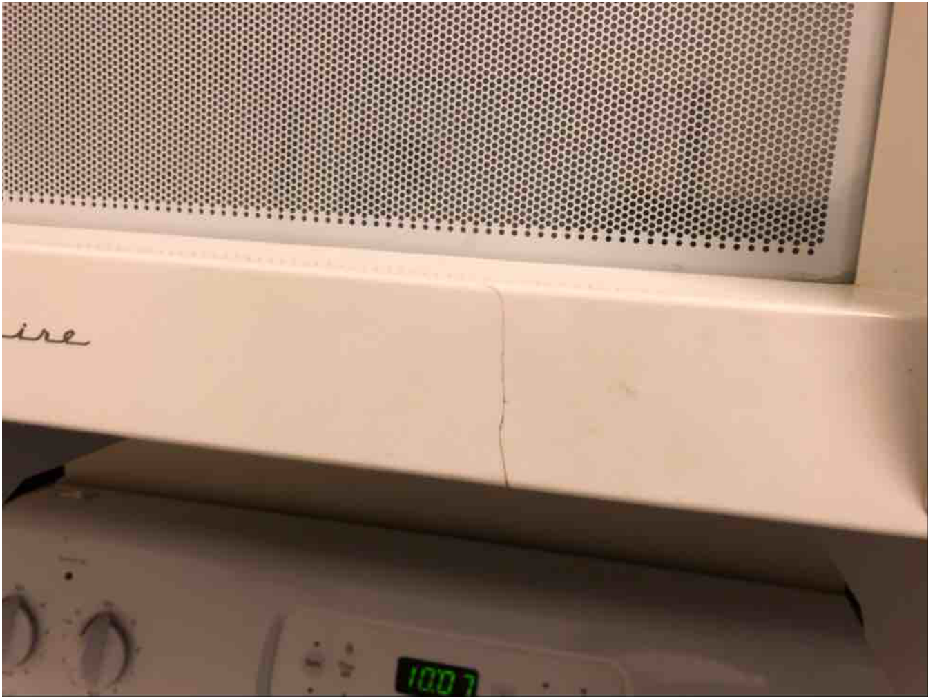
Cleaning of Stove: Not Ok