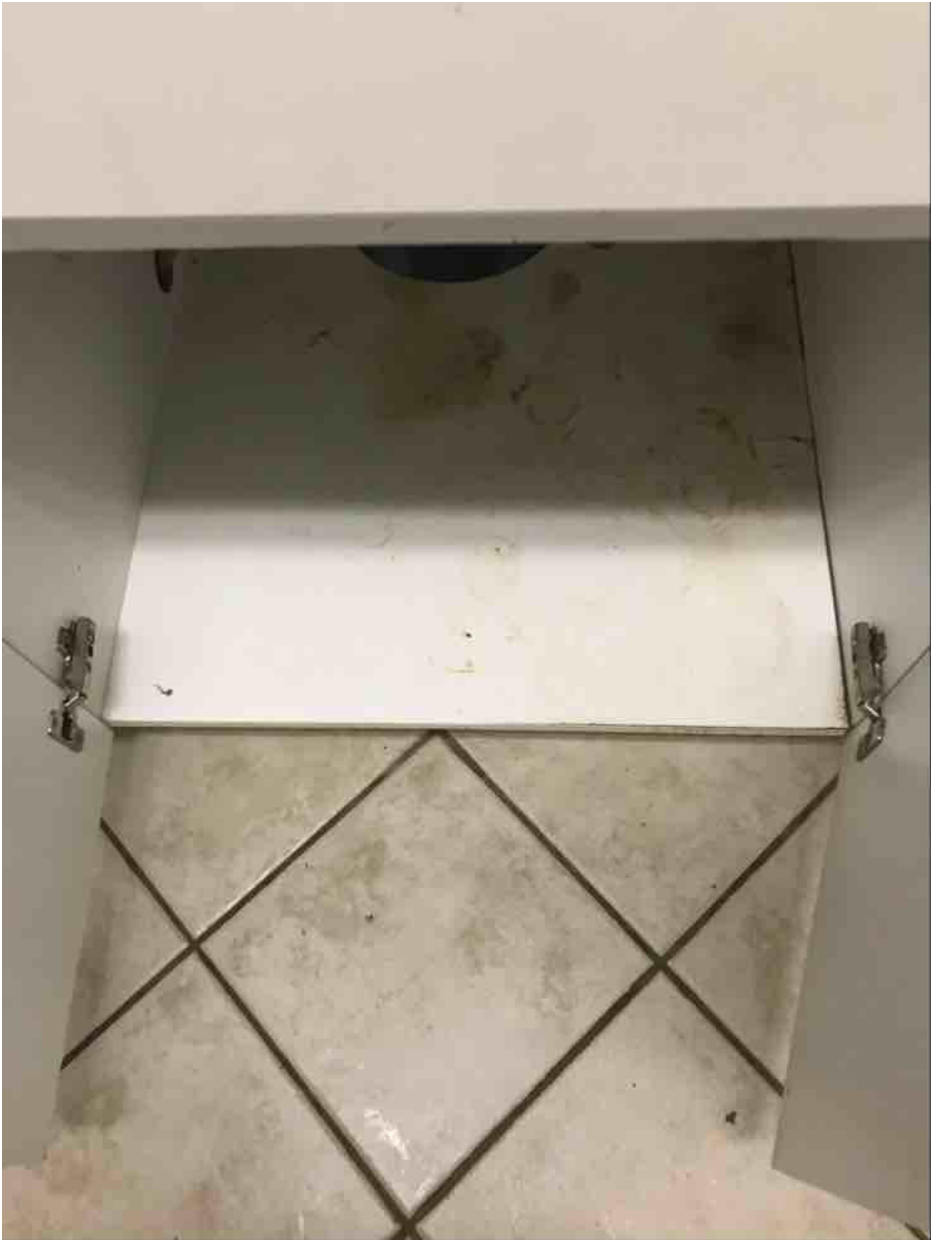
Cleaning of Stove: Not Ok