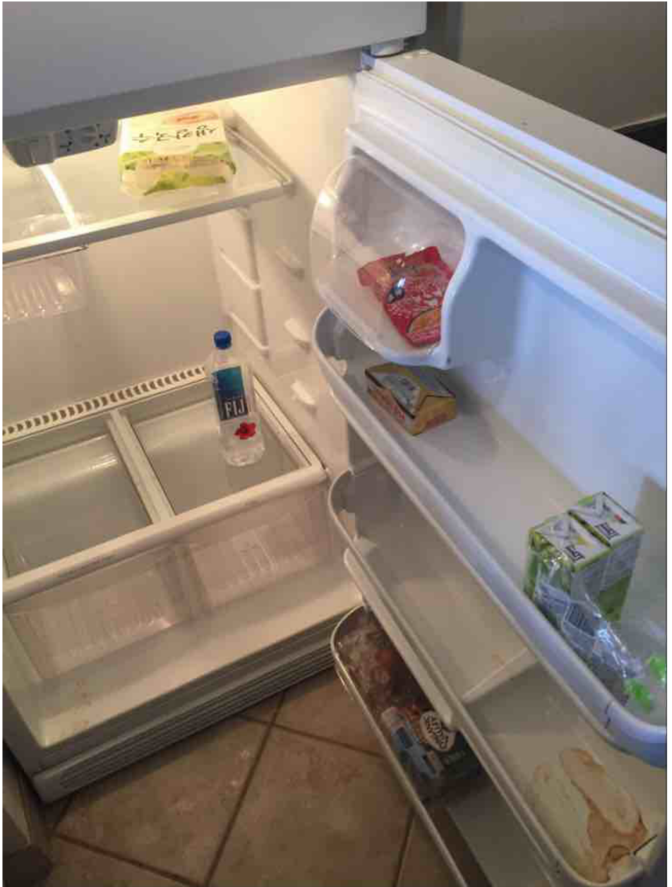
Other: Not Ok