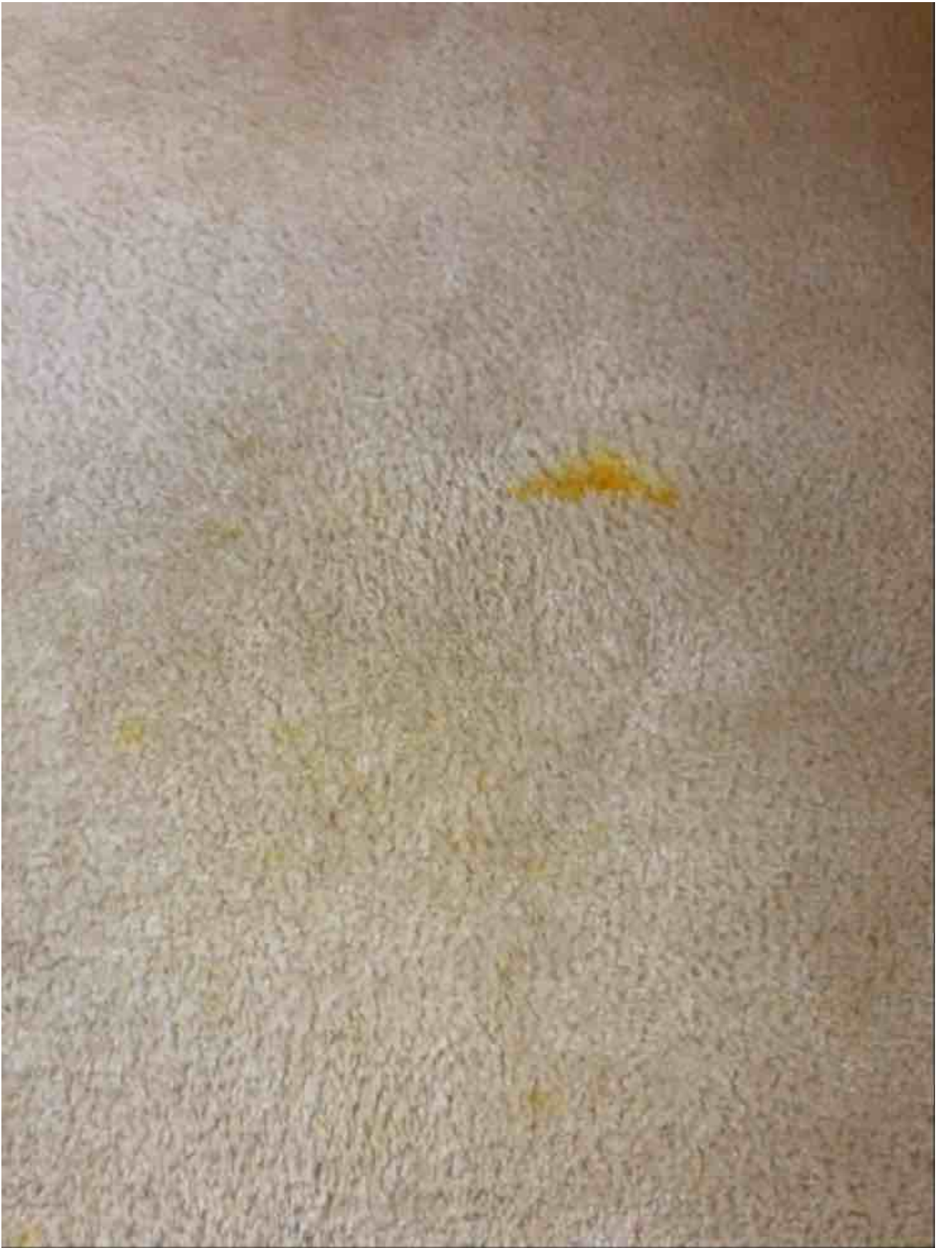
Stain Removal: Not Ok