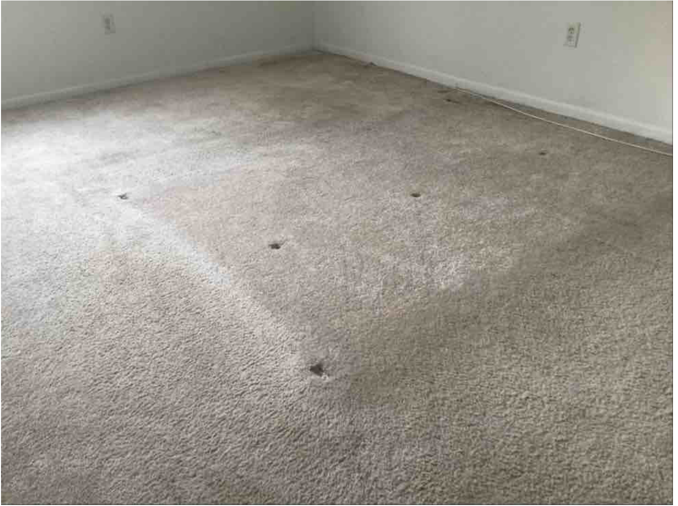
Stain Removal: Not Ok