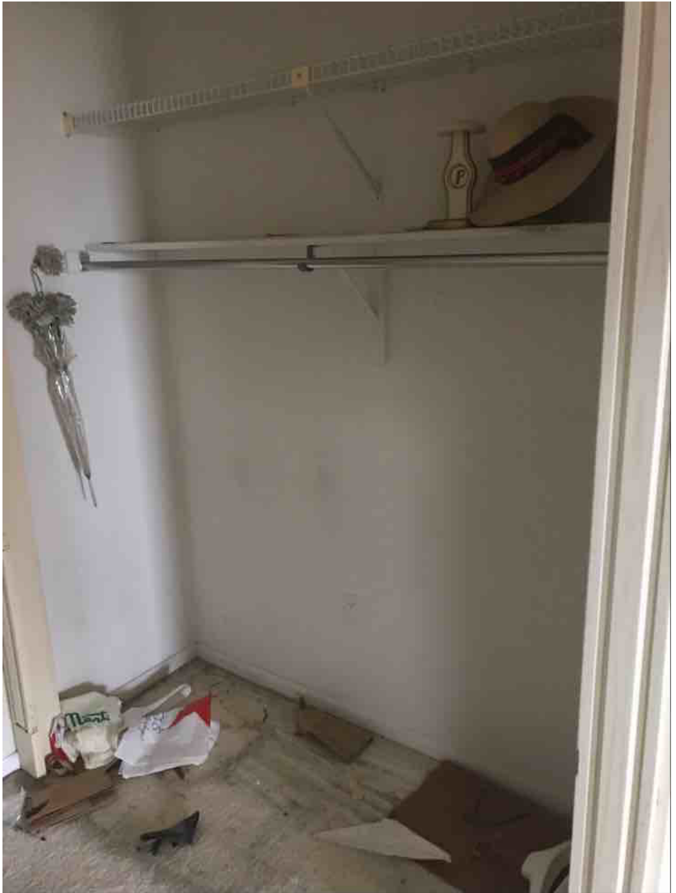
Other: Not Ok