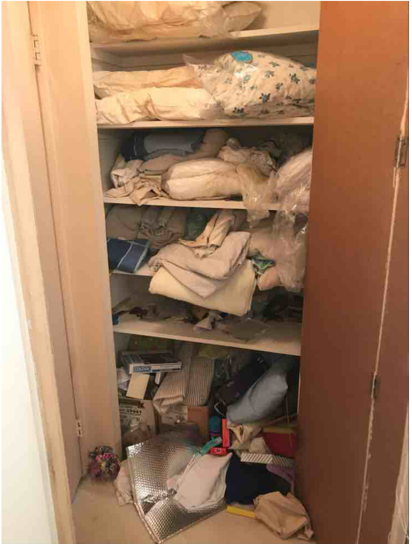
Other: Not Ok