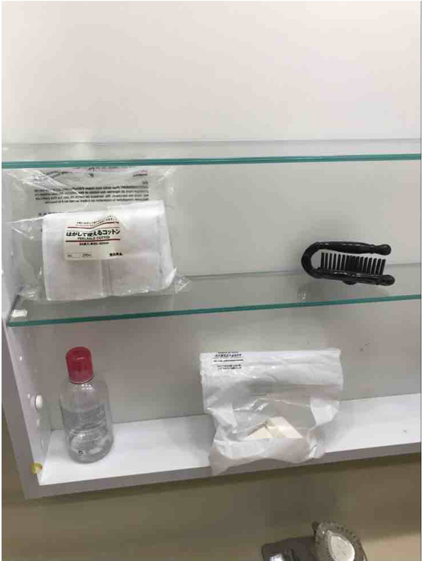
Counter Top: Not Ok