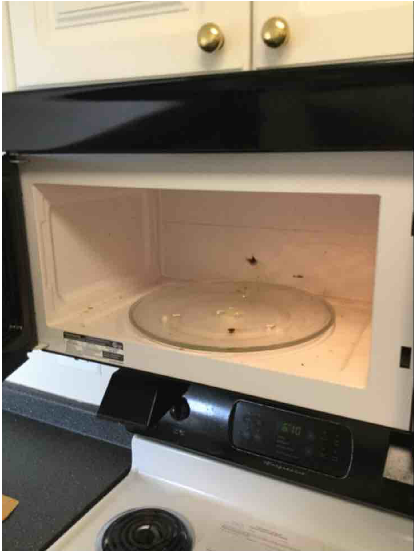
Cleaning of Stove: Not Ok