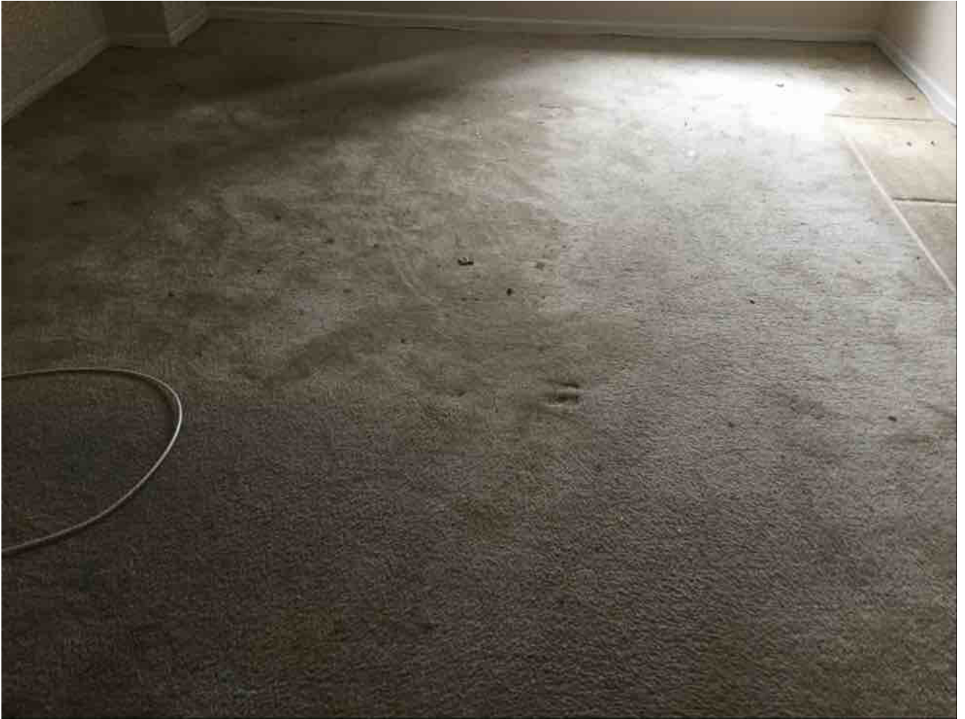
Shampoo 2 Bedroom: Not Ok