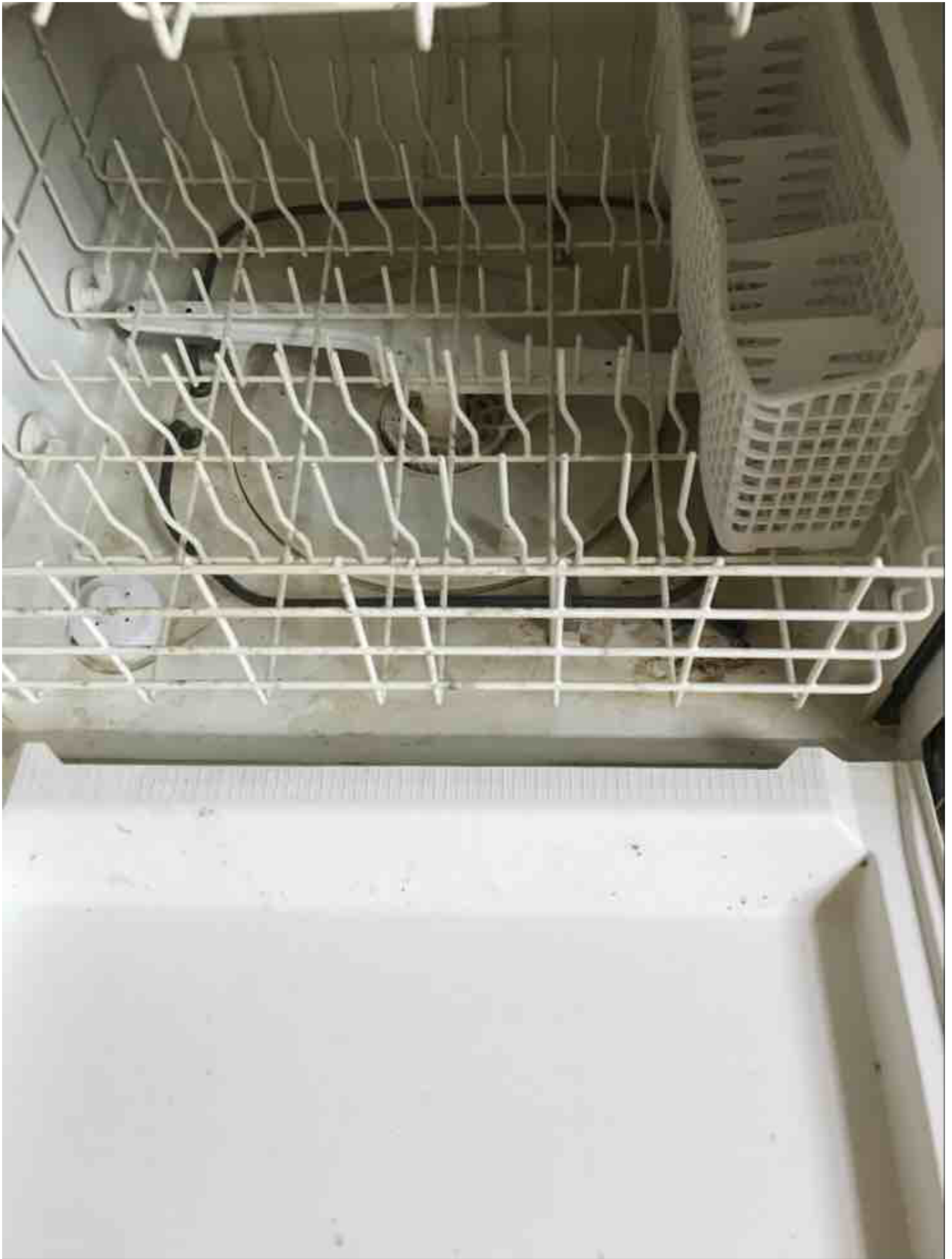
Microwave: Not Ok