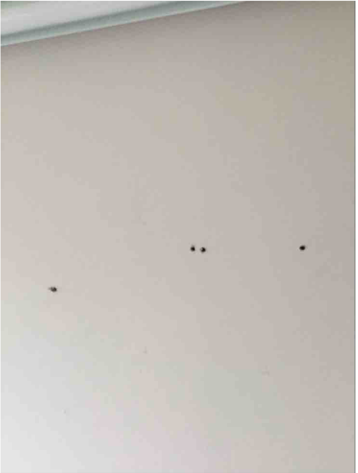
Wallpaper Removal (Per Room): Not Ok