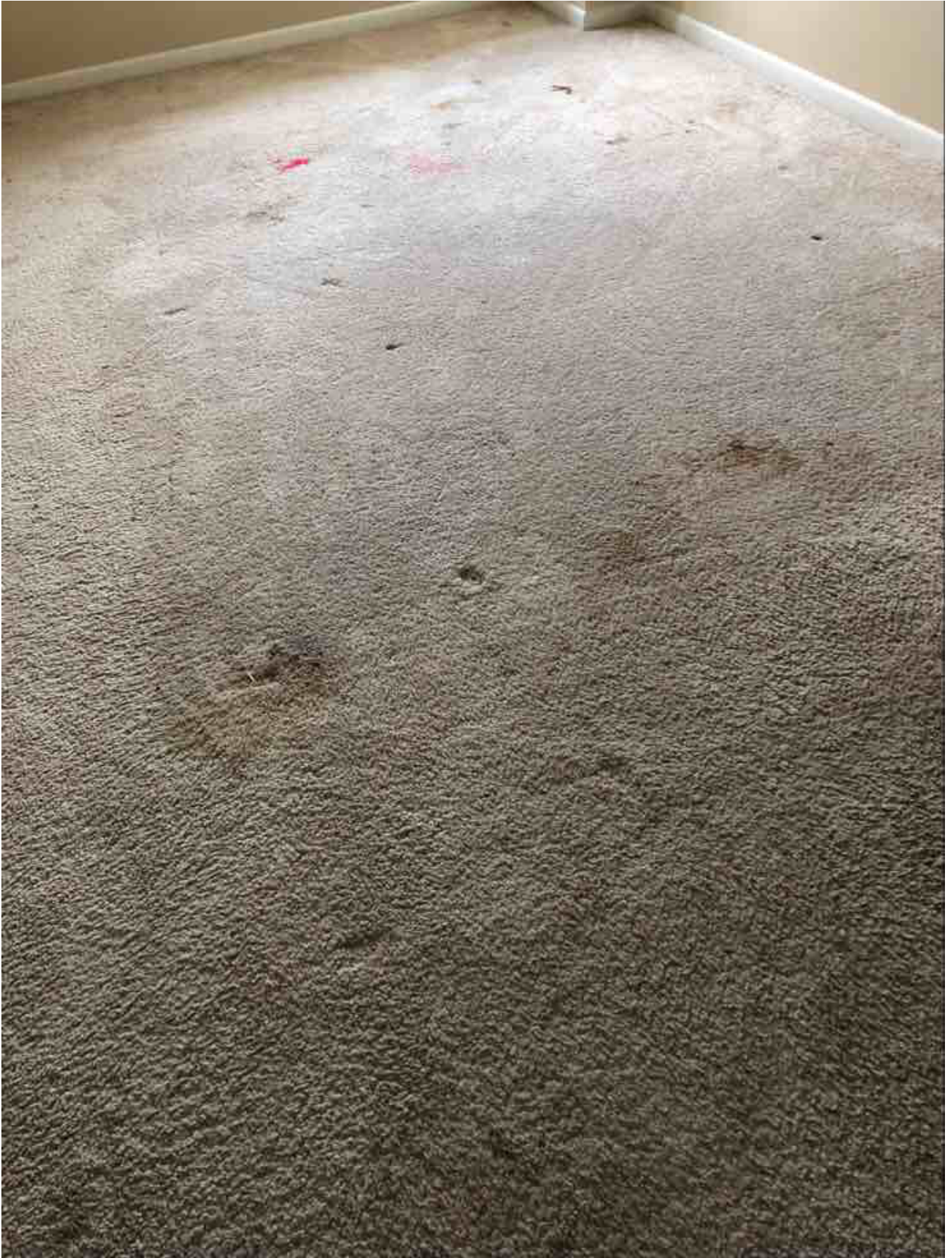
Stain Removal: Not Ok