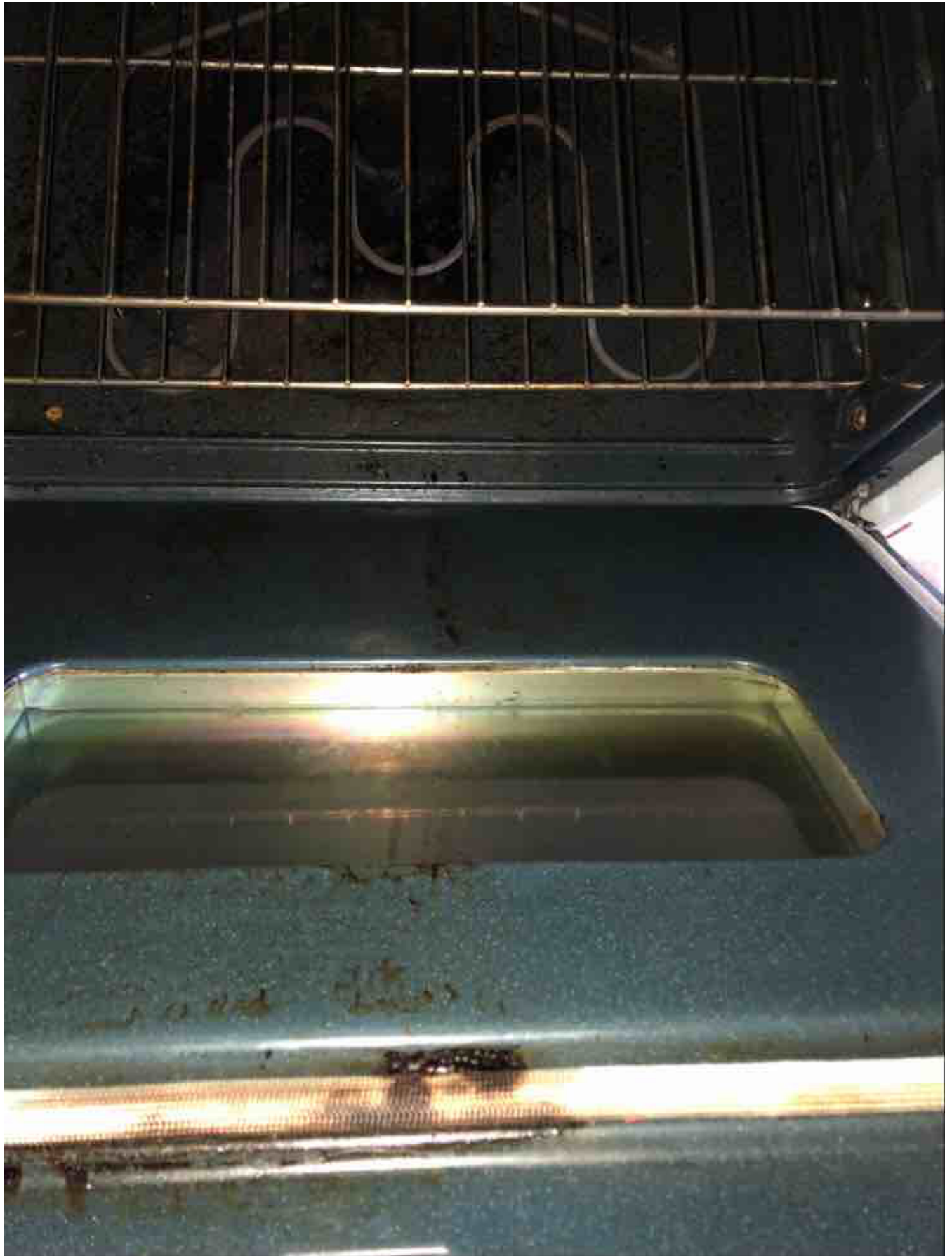
No personal items: Not Ok