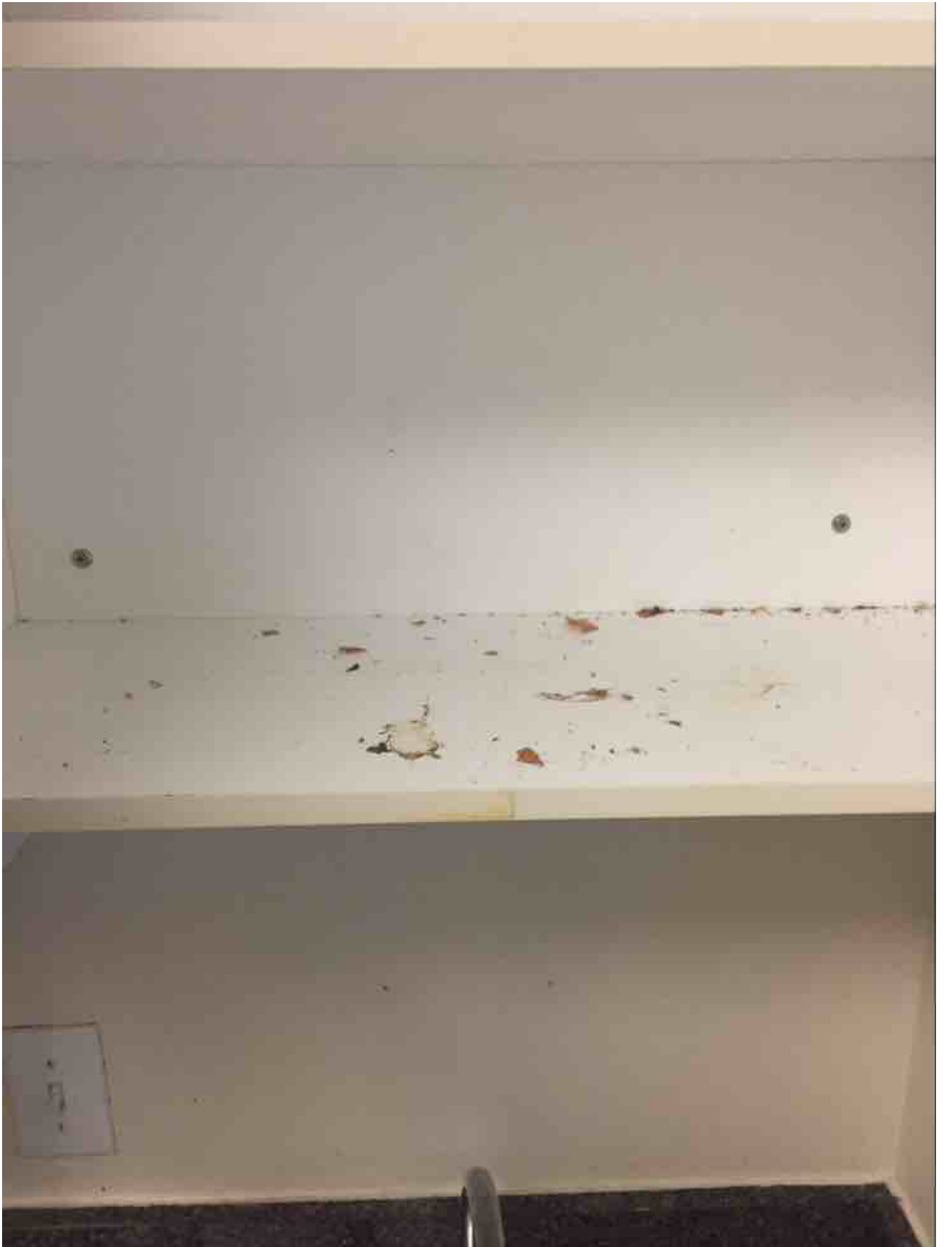
Cleaning Refrigerator: Not Ok