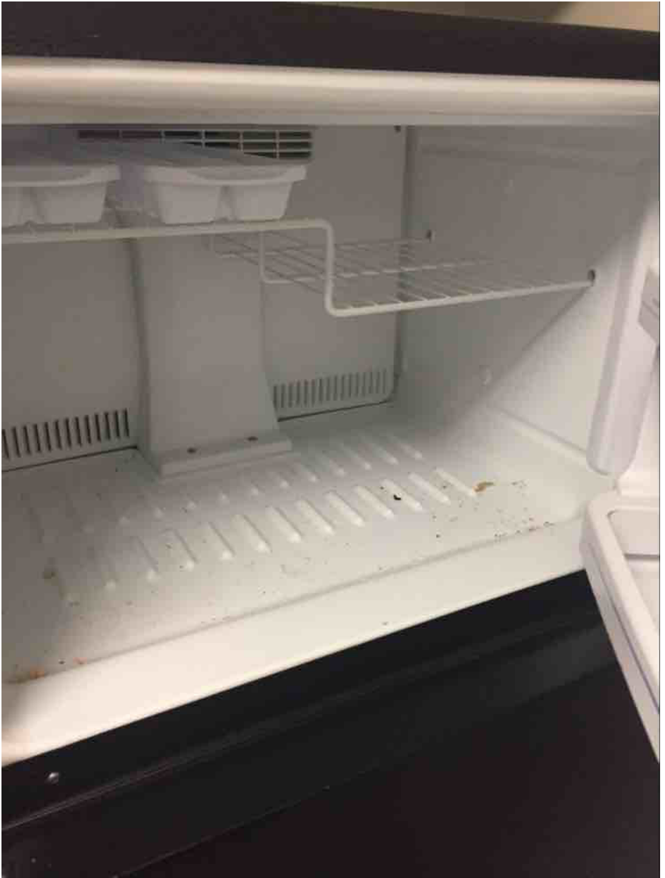
Oven Racks: Not Ok