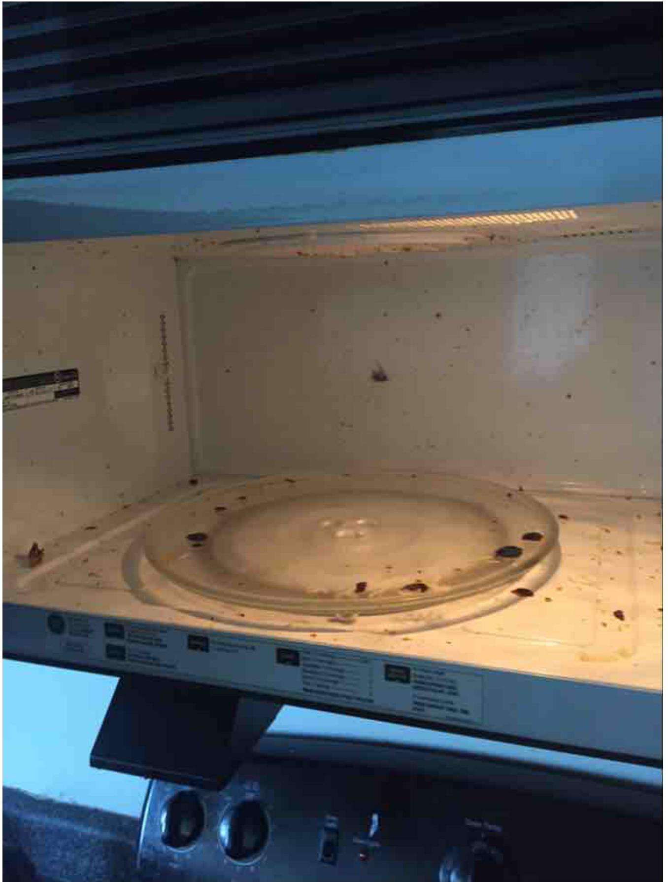
Cleaning of Stove: Not Ok