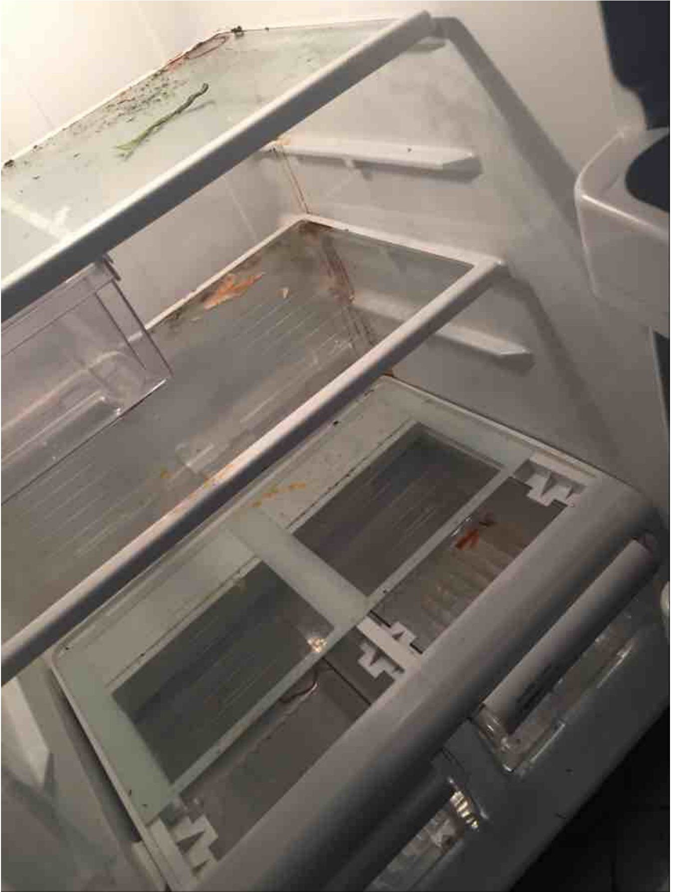
Microwave: Not Ok