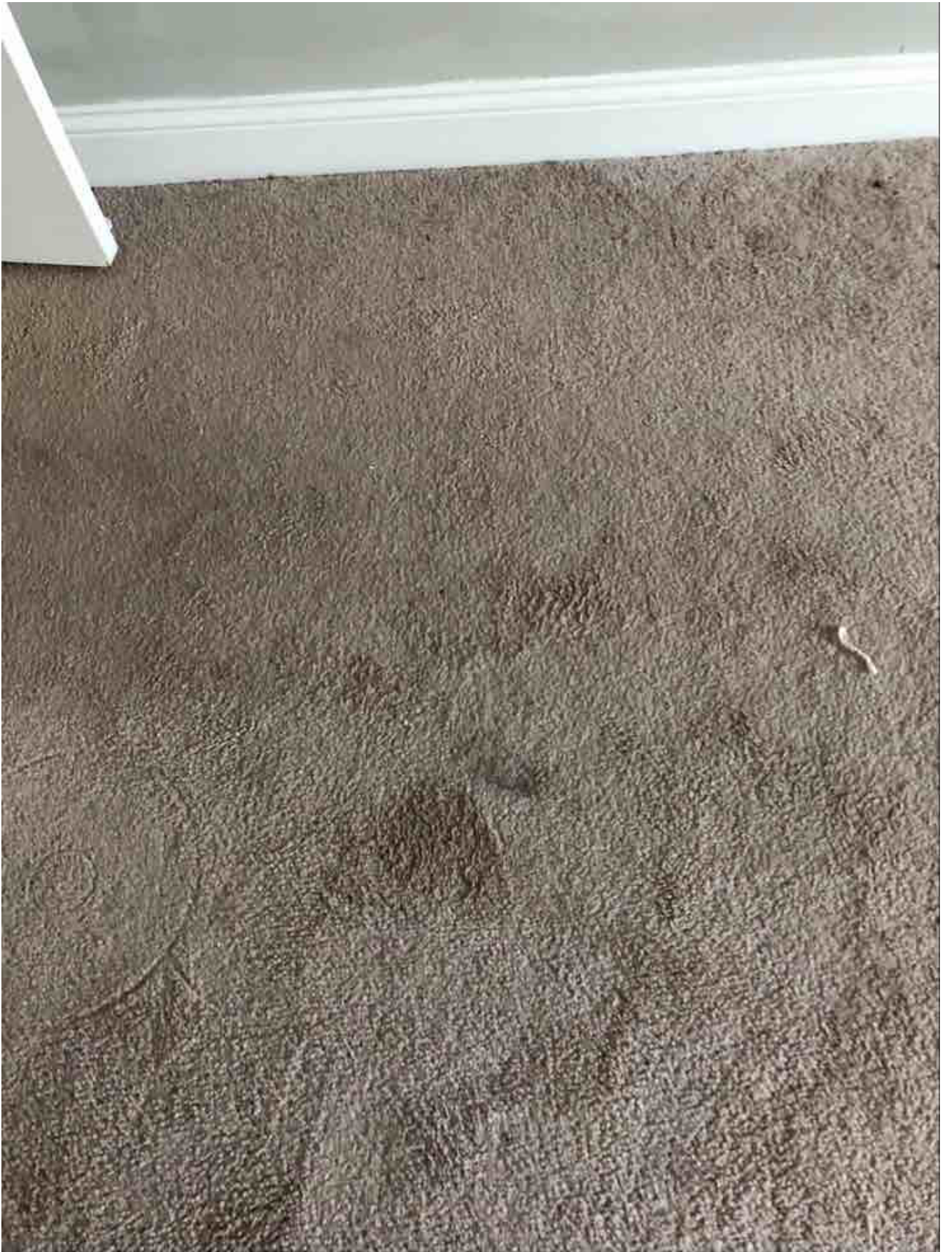
Stain Removal: Not Ok