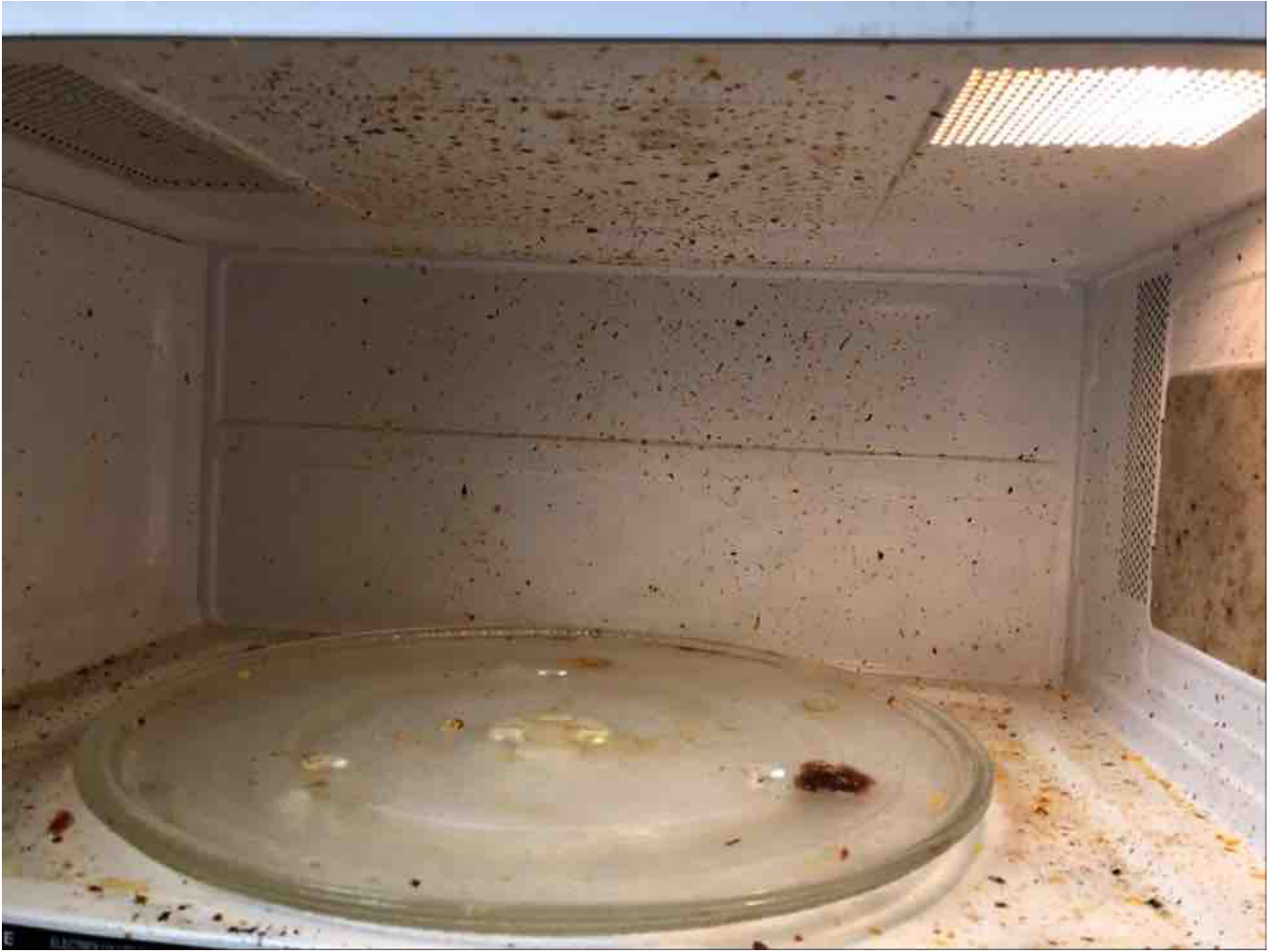
Cleaning of Stove: Not Ok