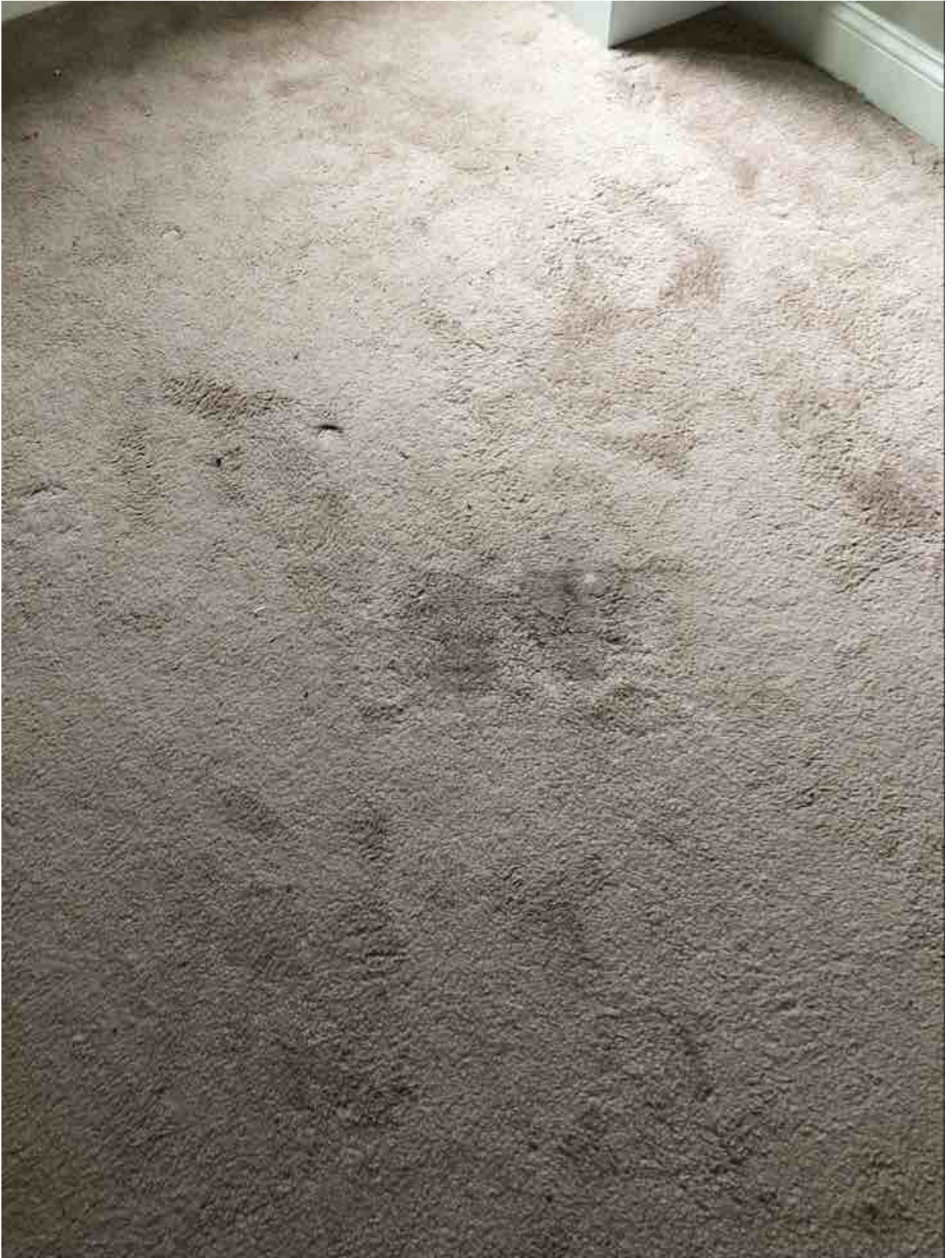
Shampoo 2 Bedroom: Not Ok