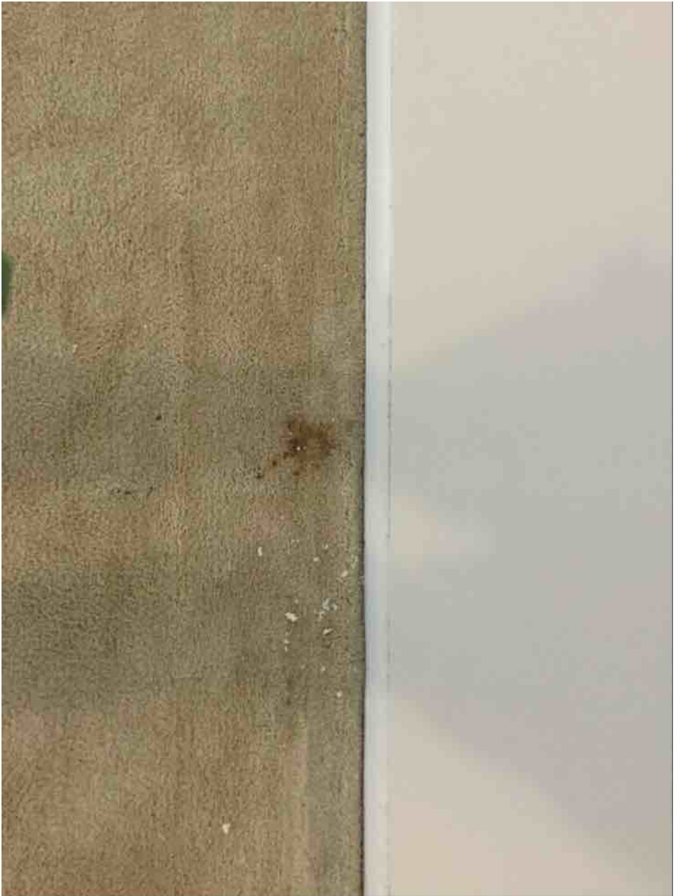
Shampoo 2 Bedroom: Not Ok