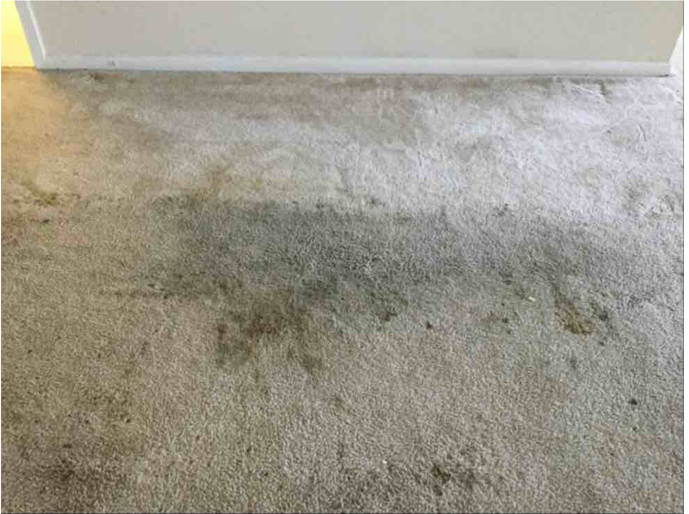
Stain Removal: Not Ok