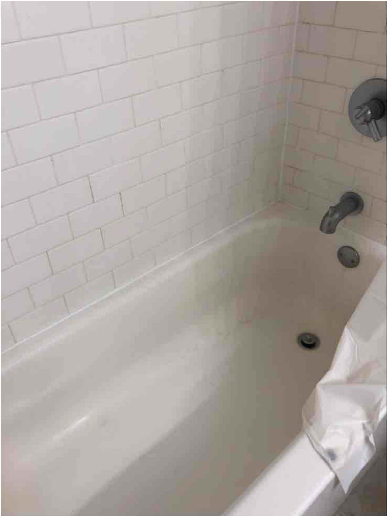
Cleaning Bathroom: Not Ok