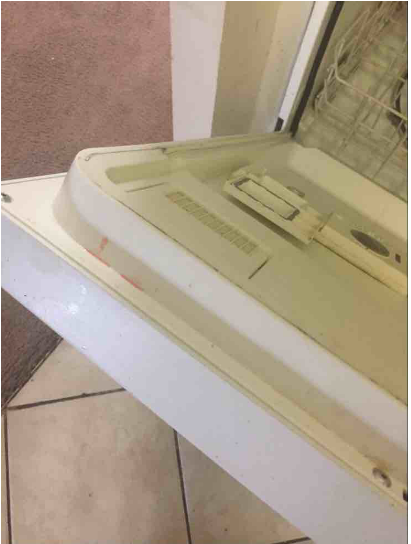
Microwave: Not Ok