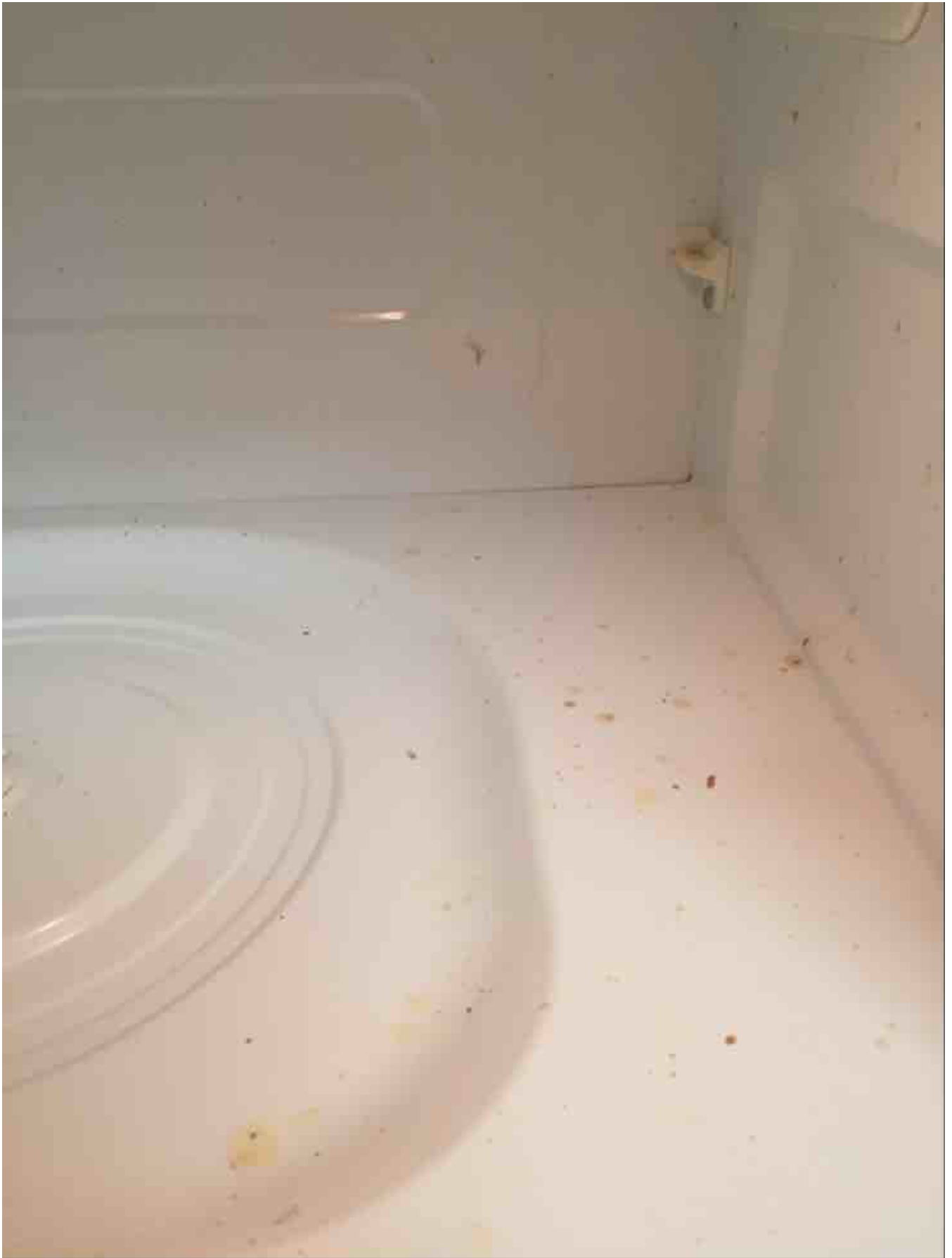
Cleaning of Stove: Not Ok