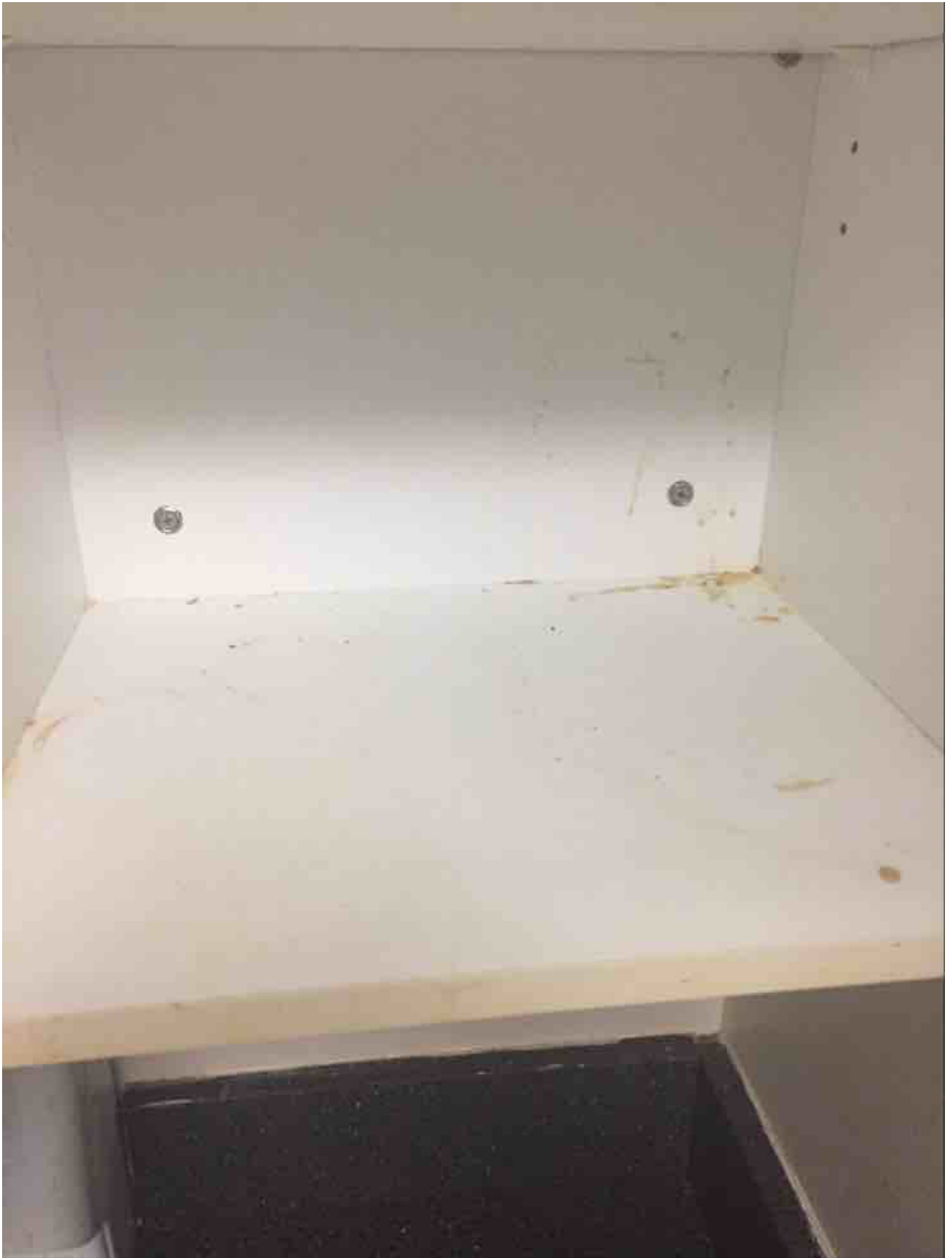
Cleaning Refrigerator: Not Ok