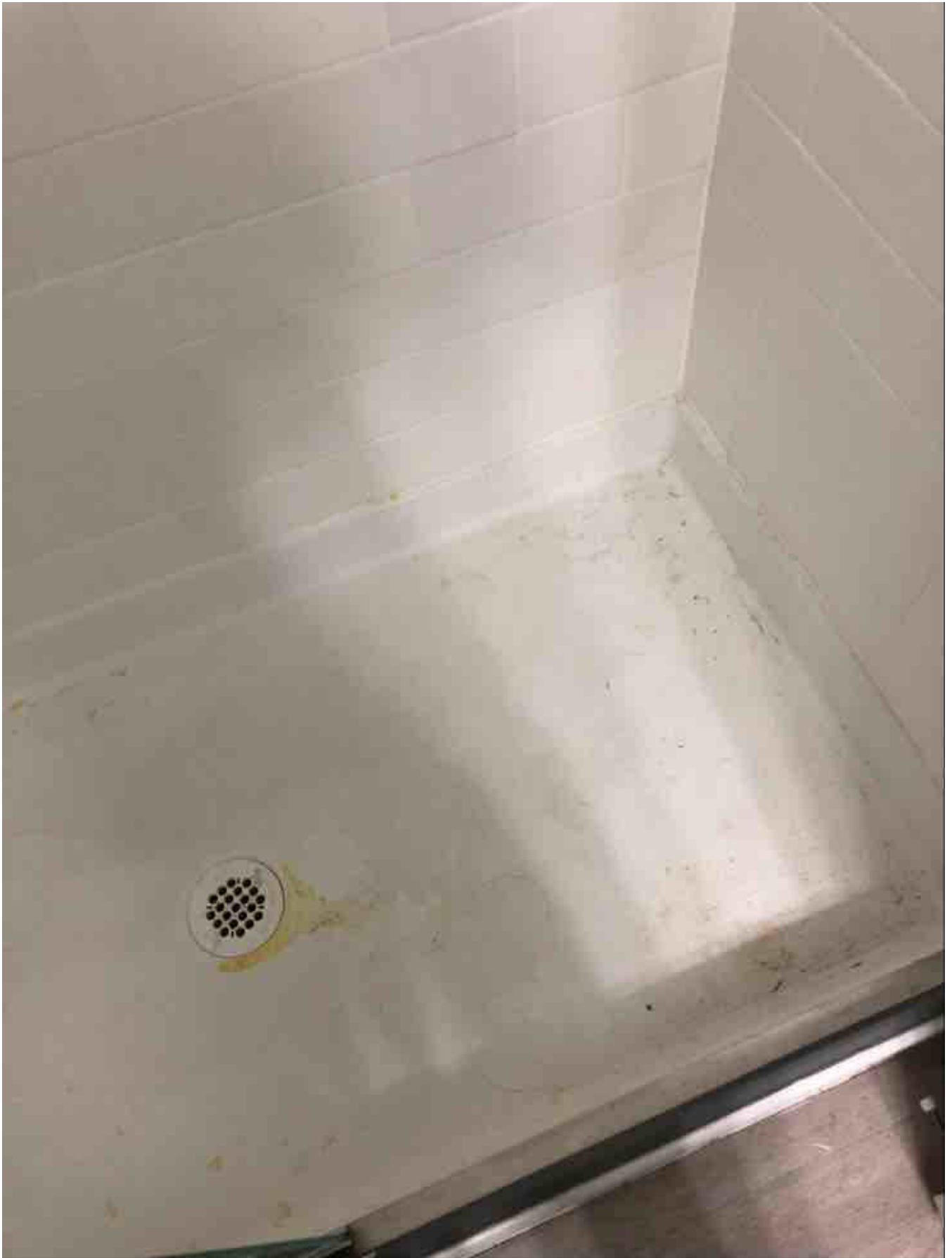
Cleaning Bathroom: Not Ok