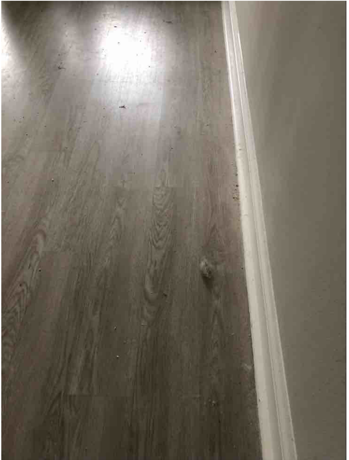
Closets cleared: Not Ok