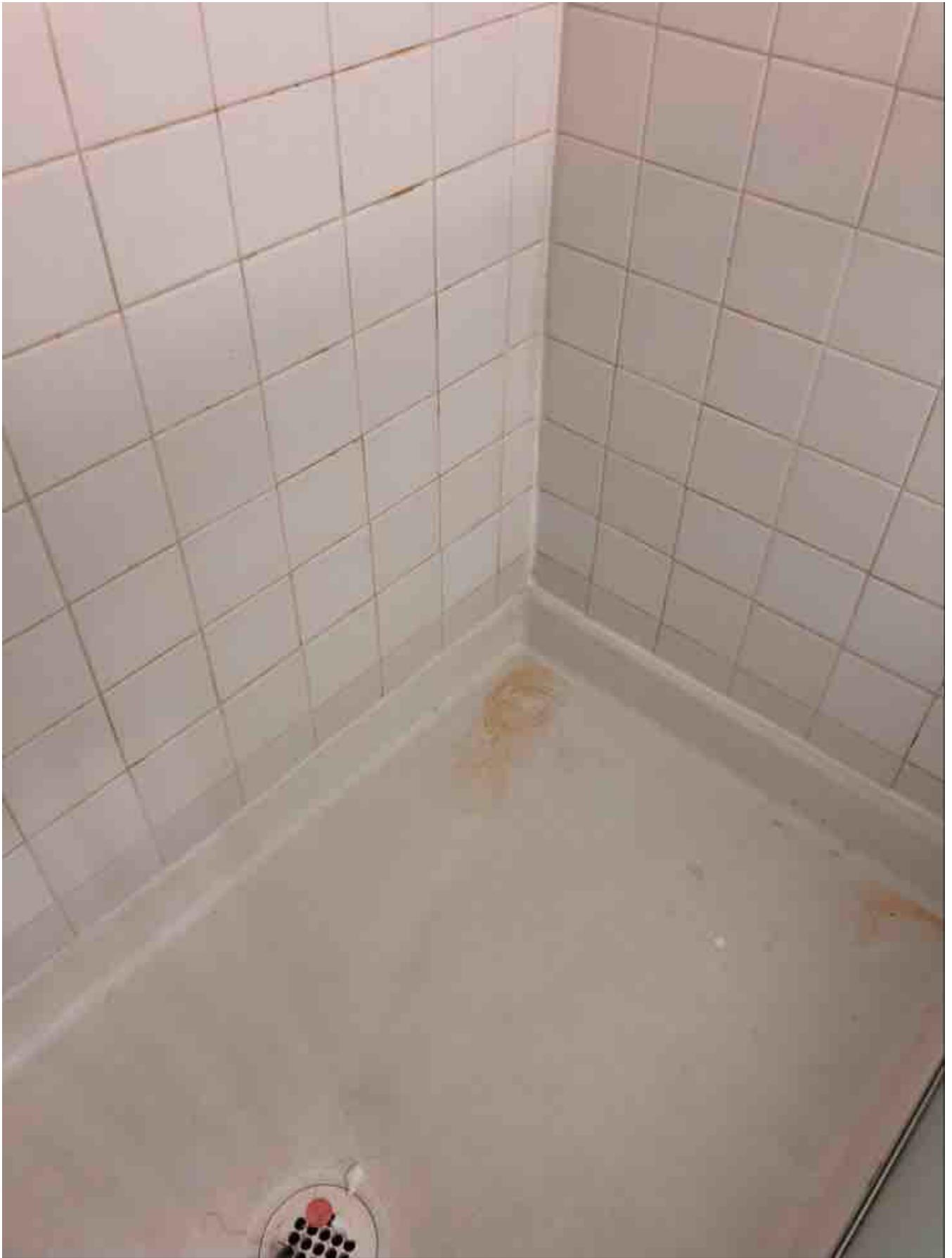
Cleaning Bathroom: Not Ok