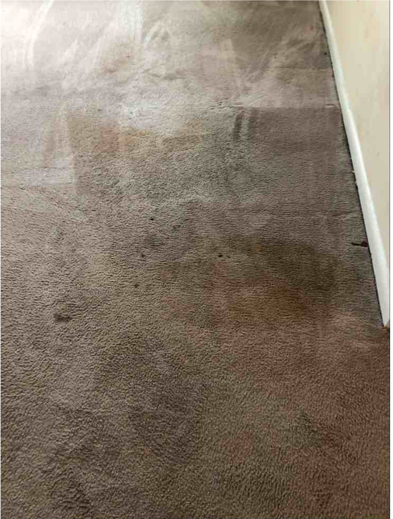
Replace Carpet 2 Bedroom: Not Ok