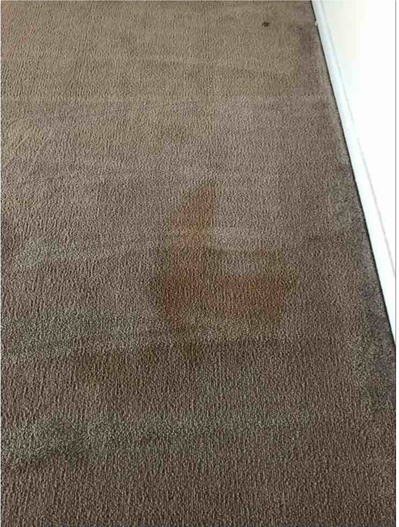
Shampoo 2 Bedroom: Not Ok