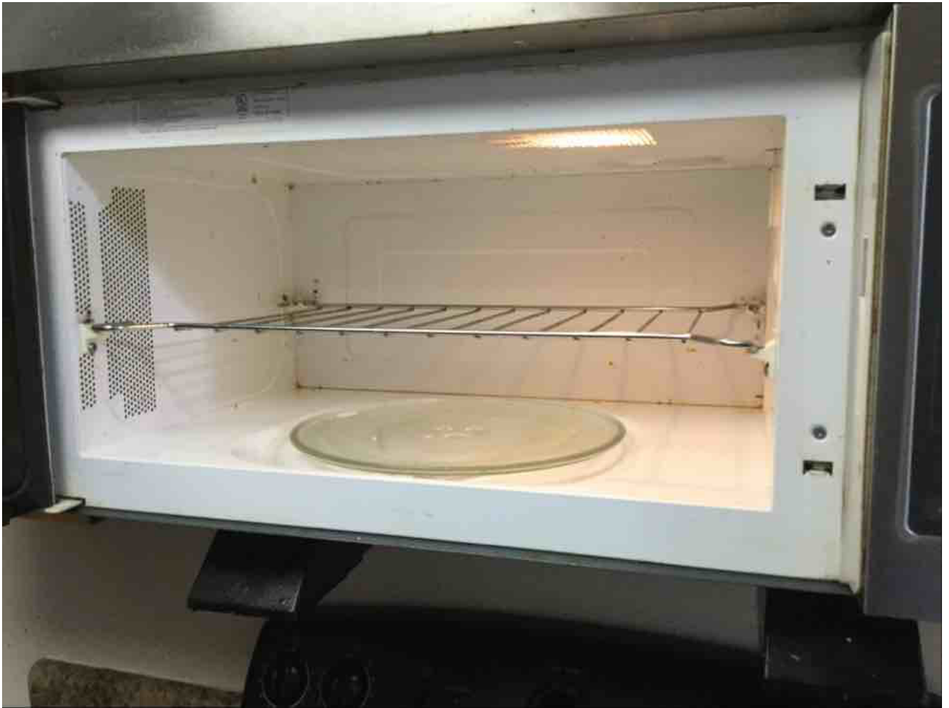
Cleaning of Stove: Not Ok