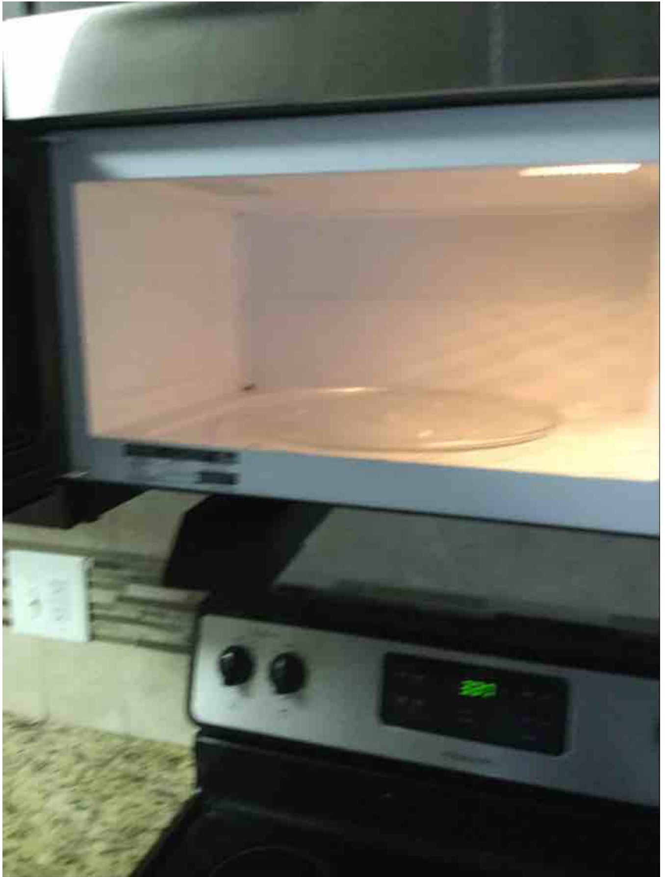
Cleaning of Stove: Not Ok