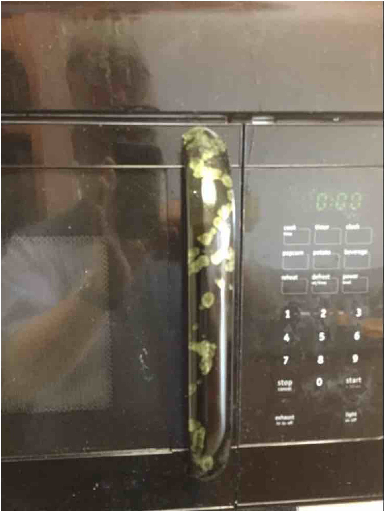
Cleaning of Stove: Not Ok