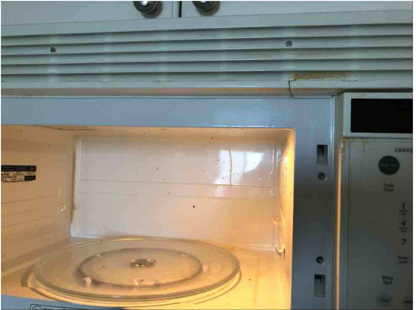
Cleaning of Stove: Not Ok