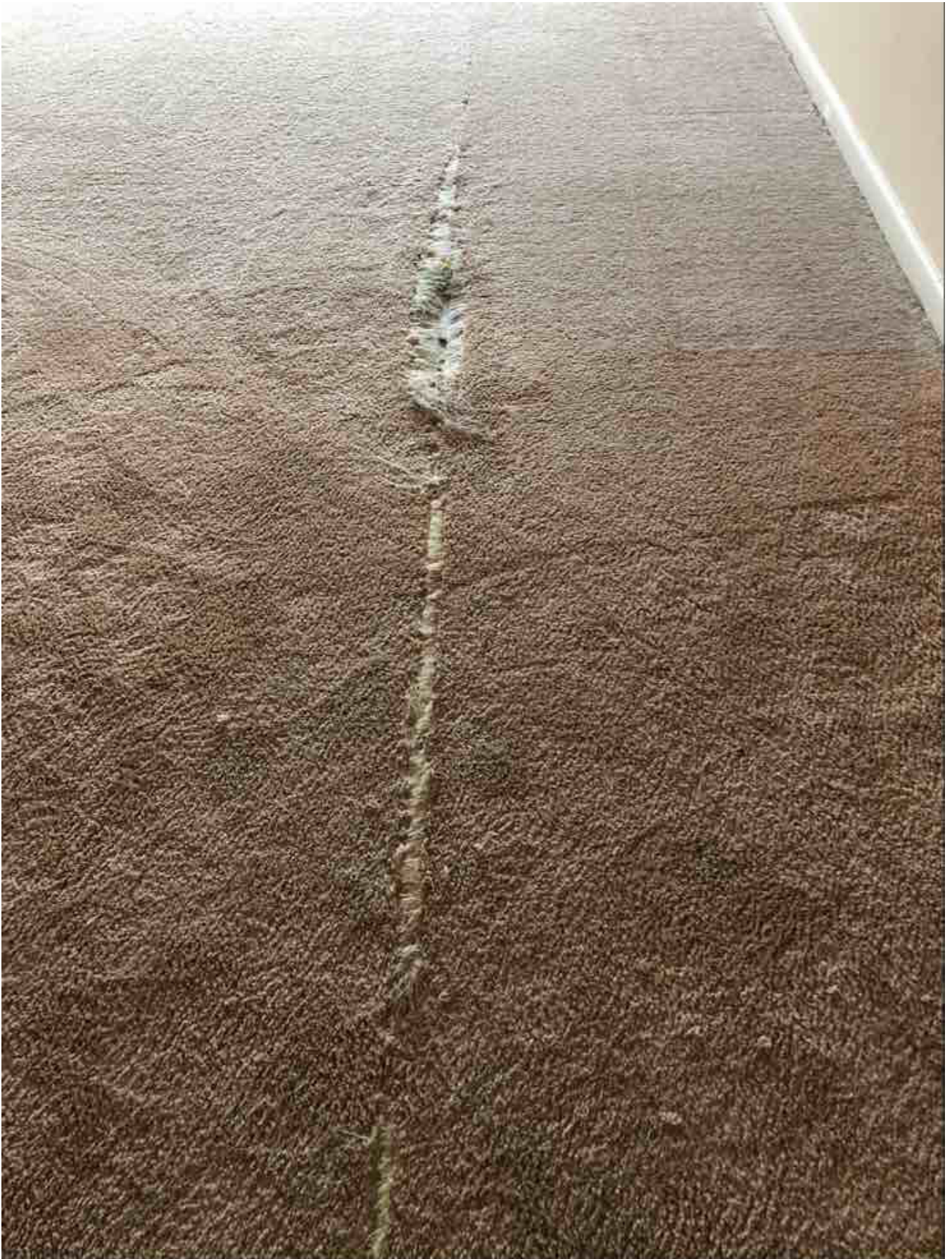
Shampoo 2 Bedroom: Not Ok