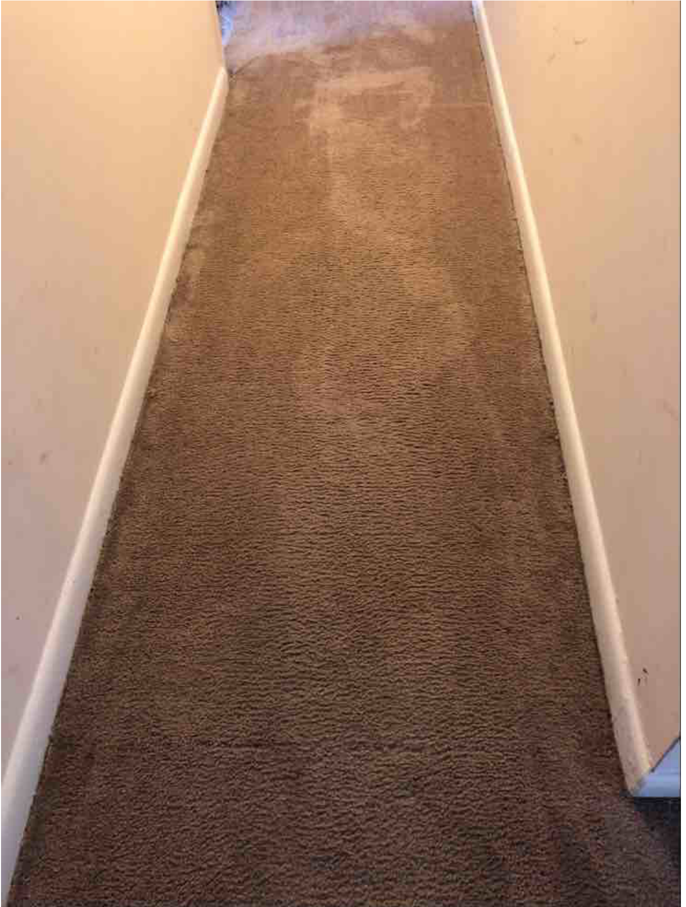
Stain Removal: Not Ok