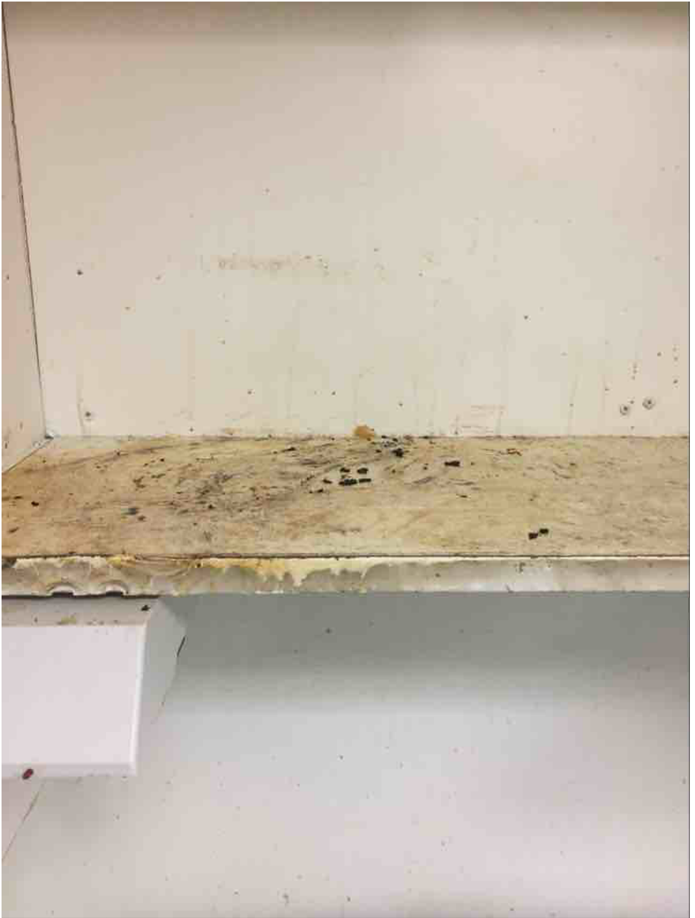
Dishwasher Rack: Not Ok