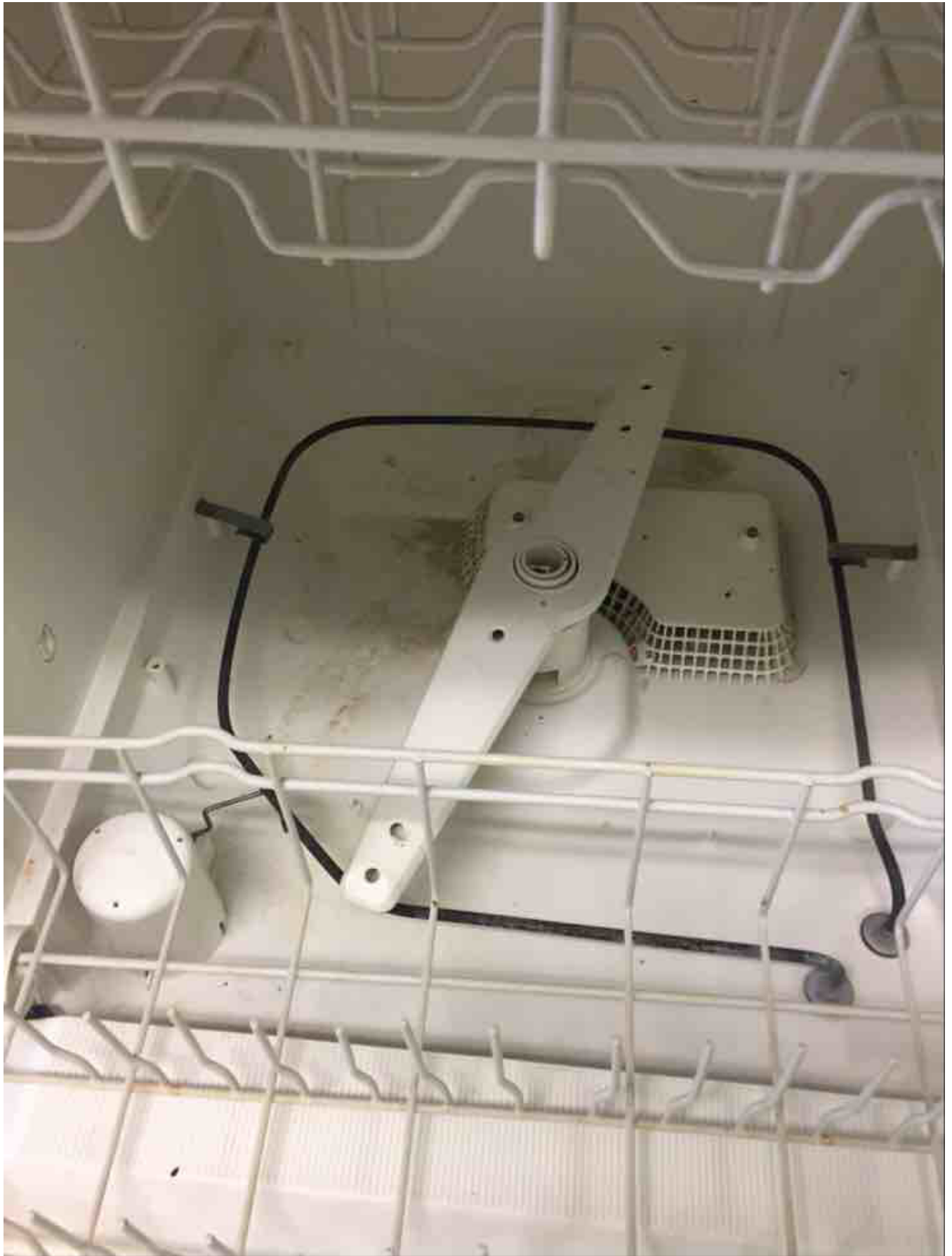
Other: Not Ok