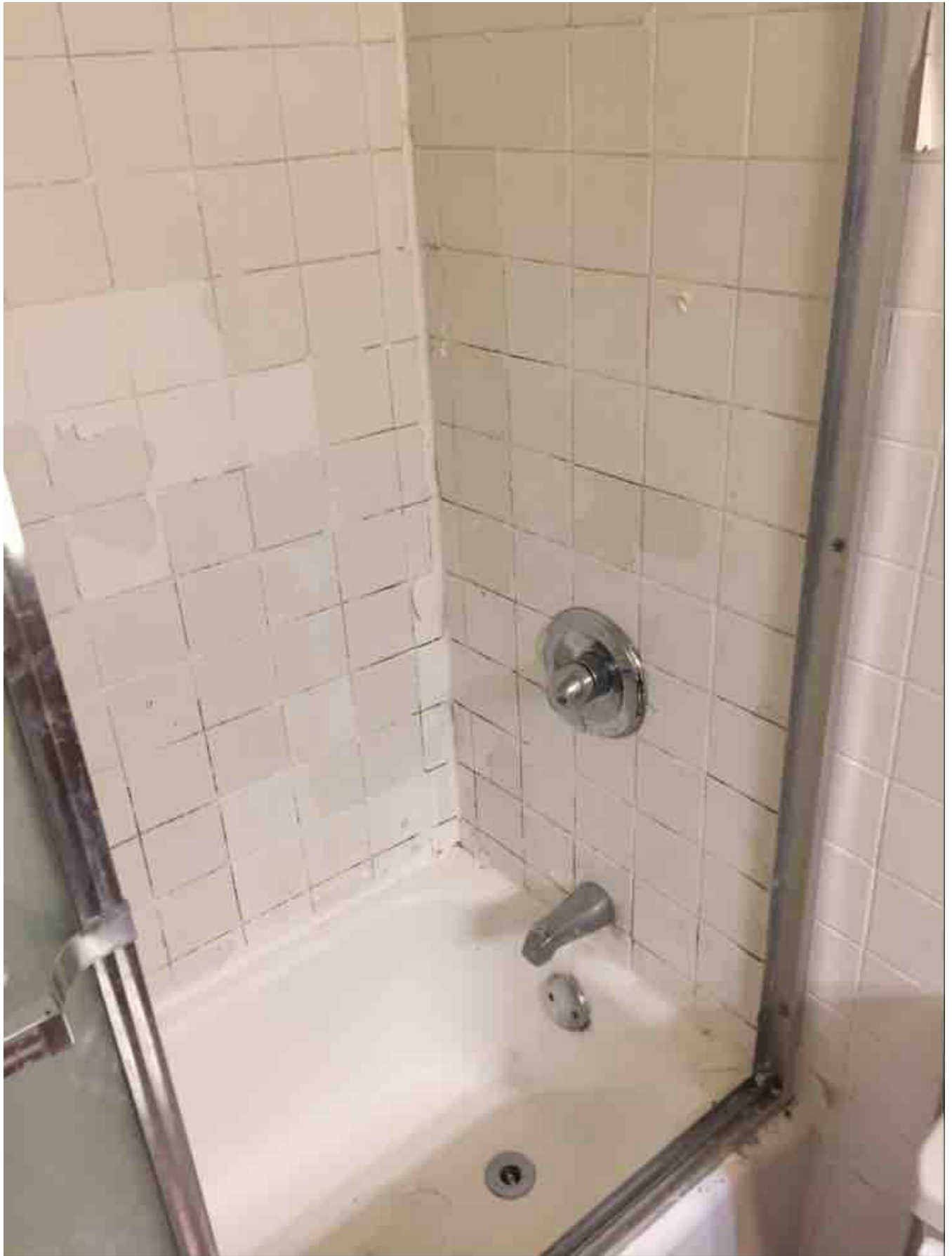
Cleaning Bathroom: Not Ok