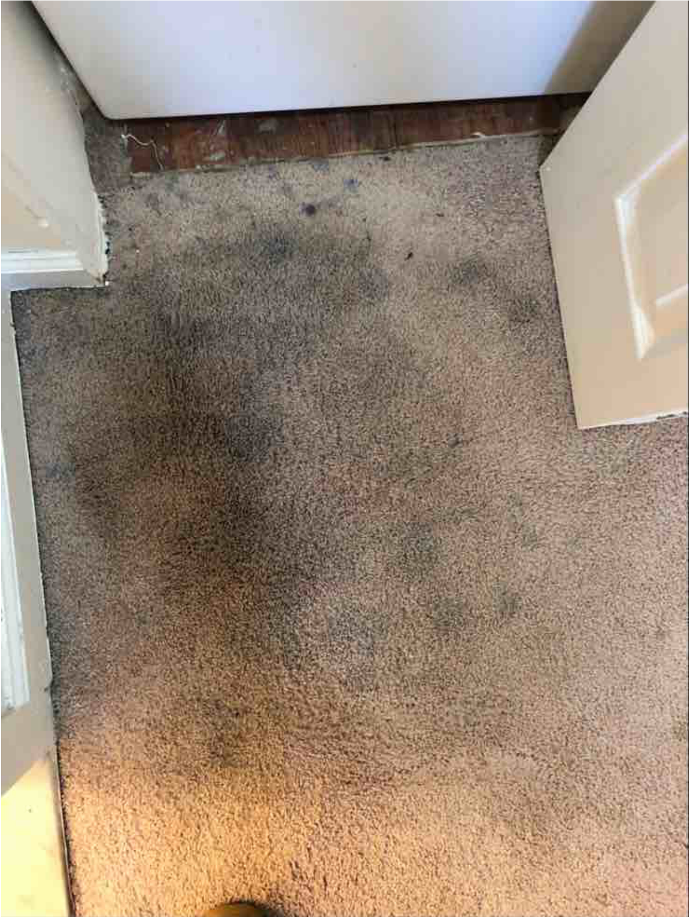
Stain Removal: Not Ok