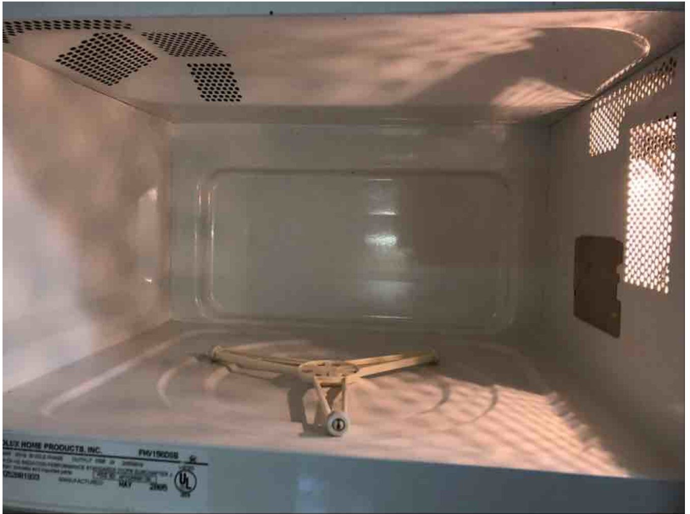
Cleaning of Stove: Not Ok