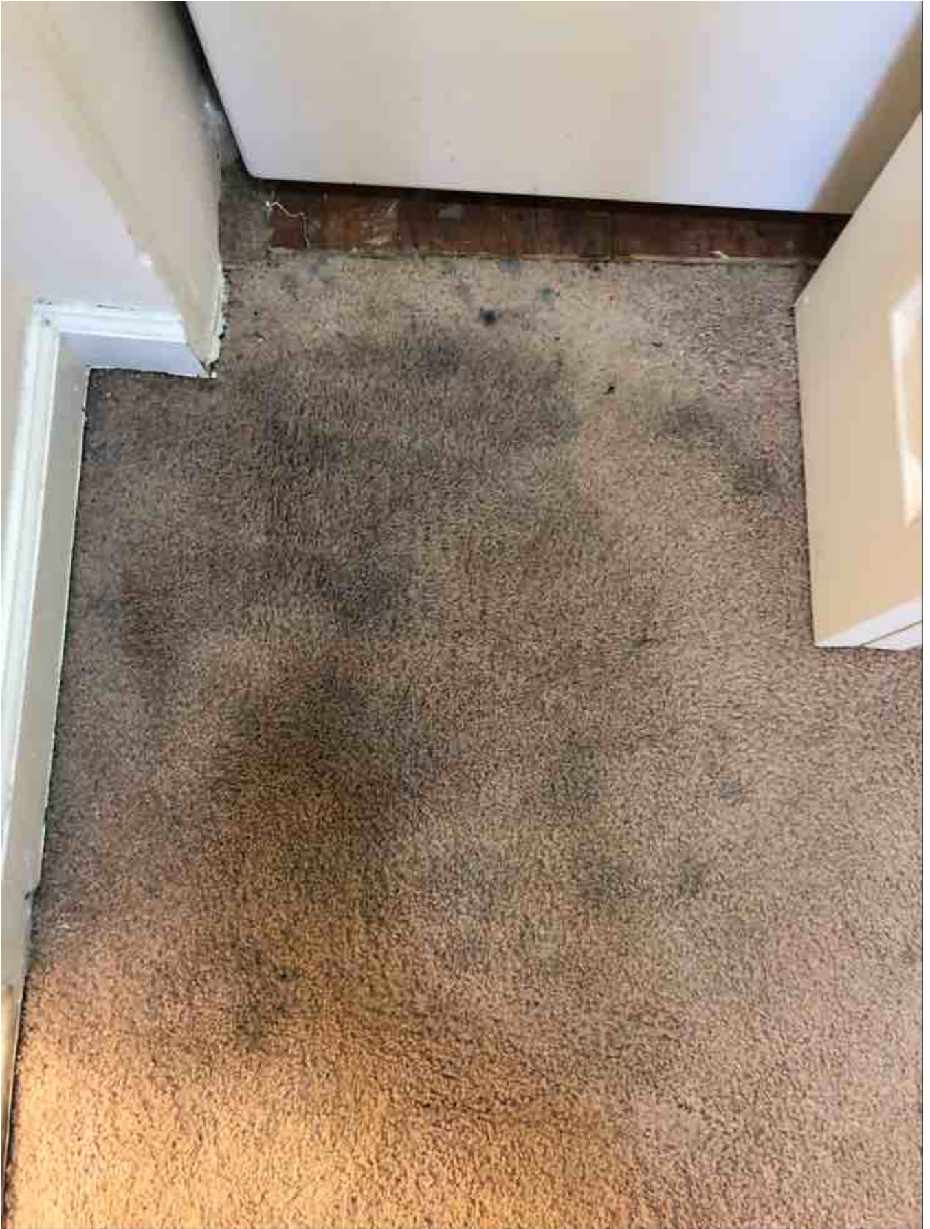
Floors / Carpet: Not Ok