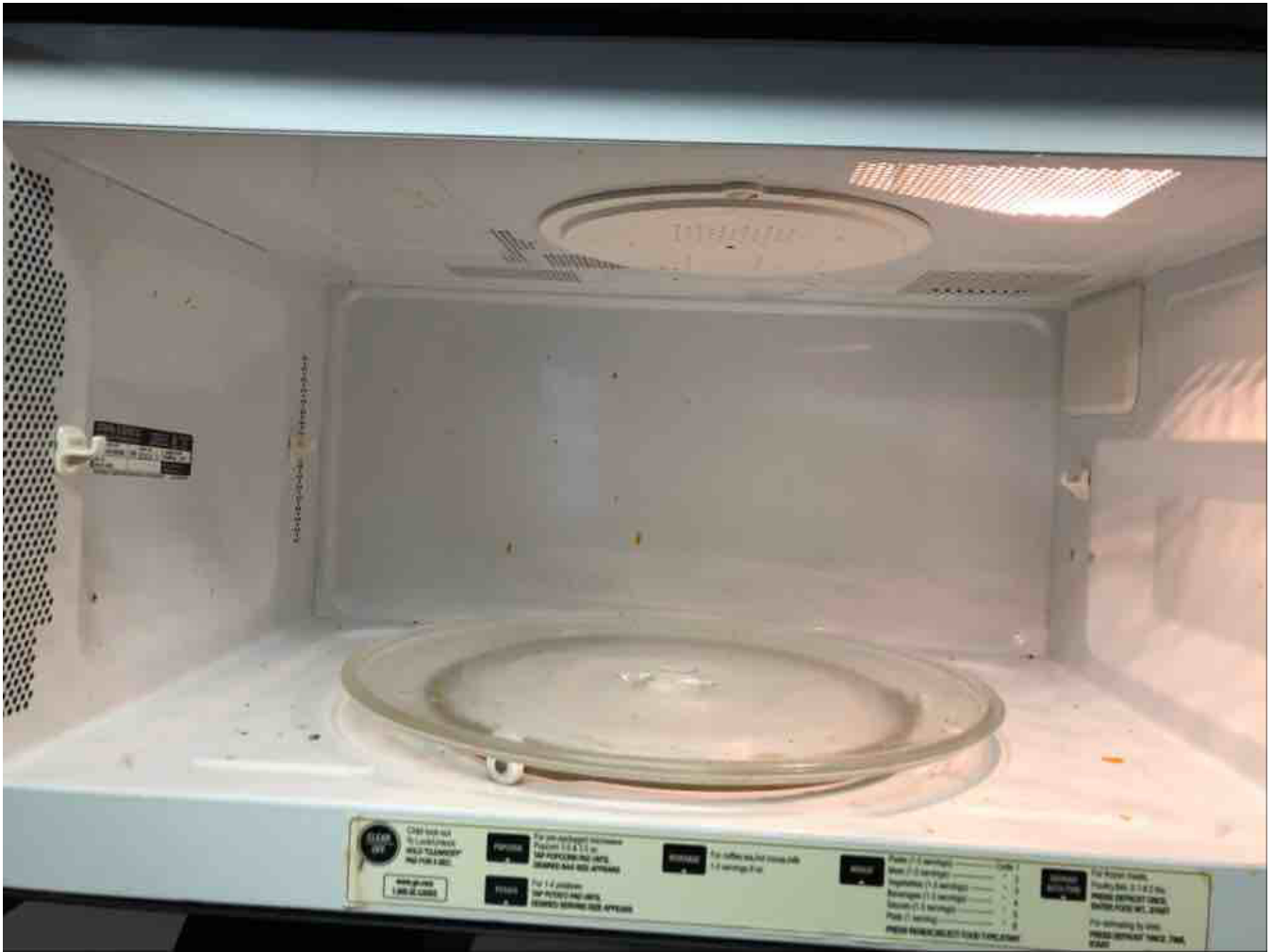
Cleaning of Stove: Not Ok