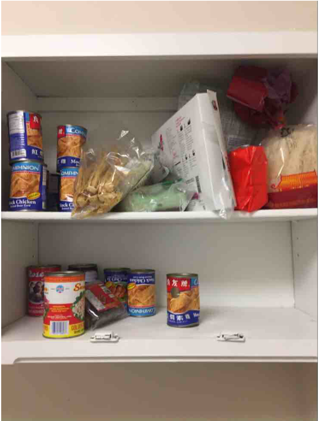
Counter Top: Not Ok