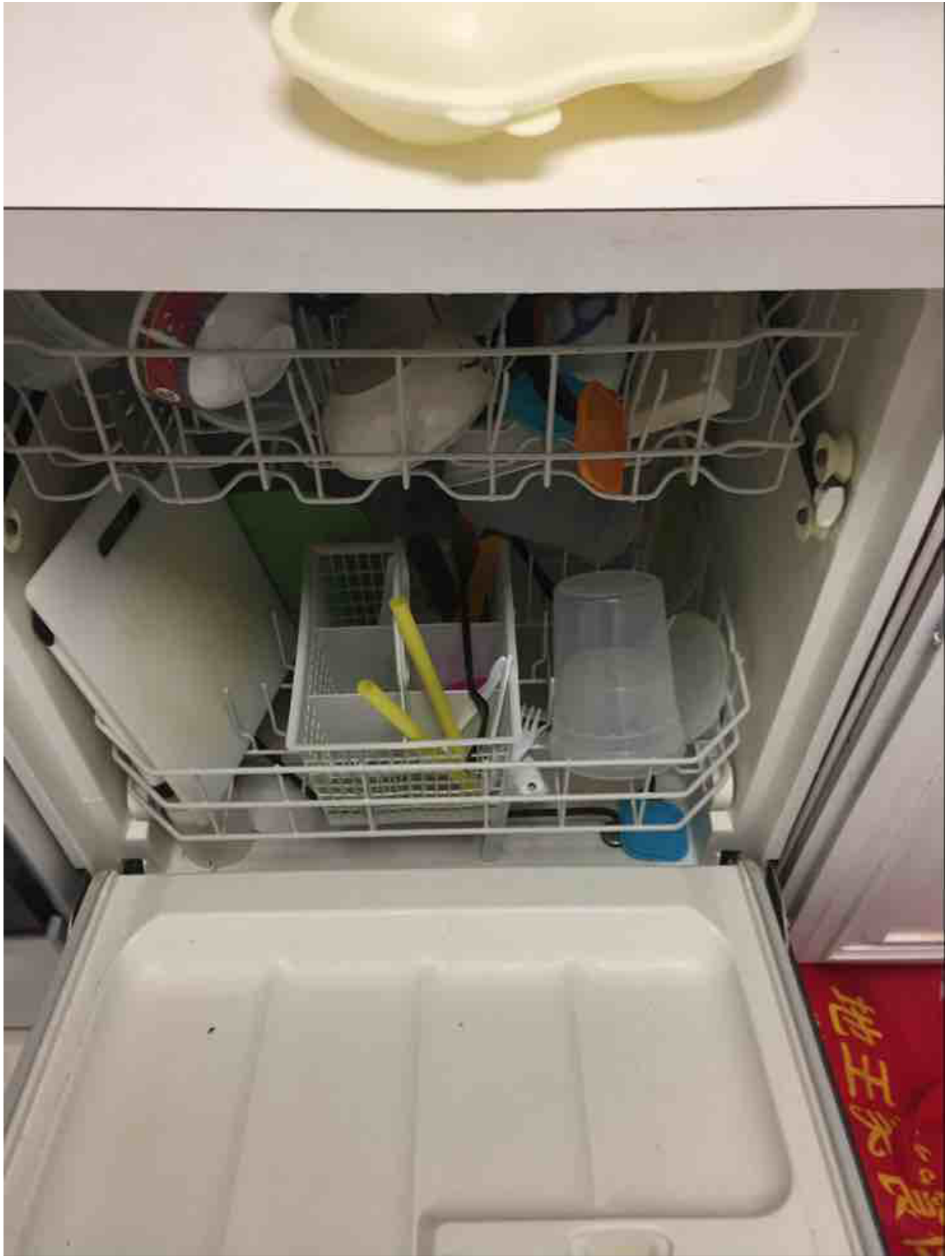
Cleaning of Stove: Not Ok