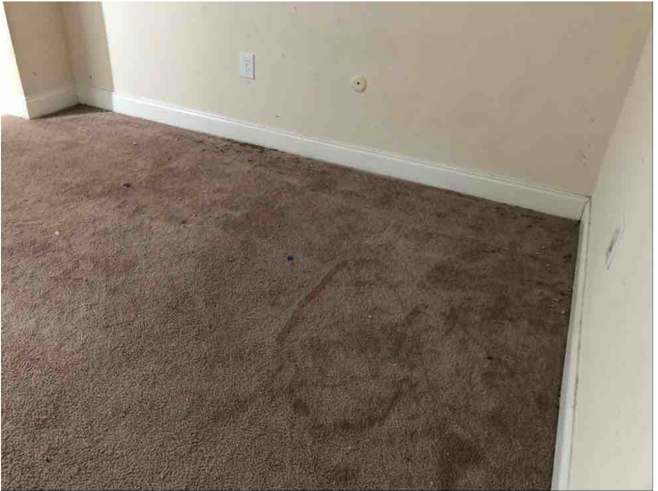
Stain Removal: Not Ok