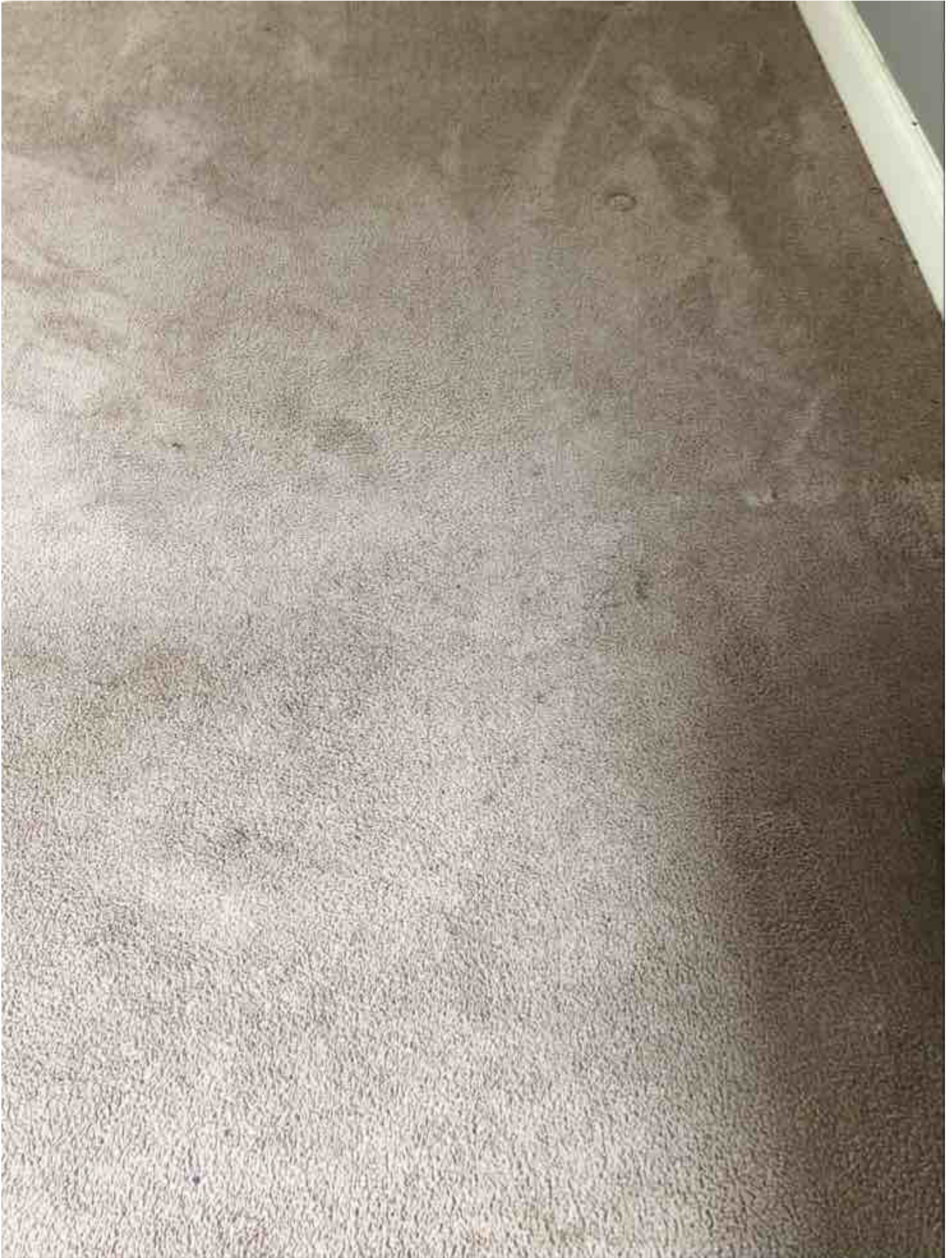
Shampoo 2 Bedroom: Not Ok