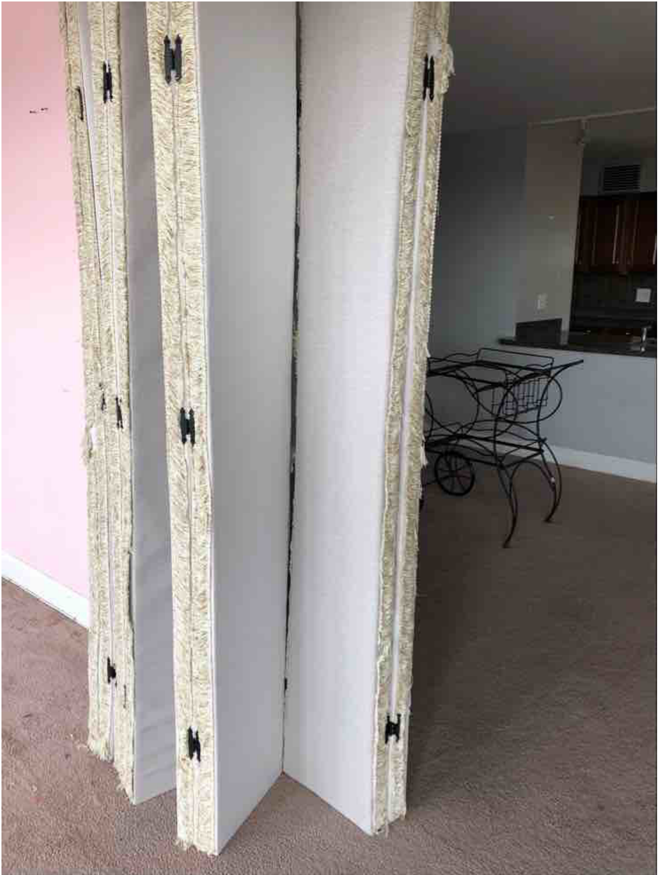
Removal Of Bulk Items: Not Ok