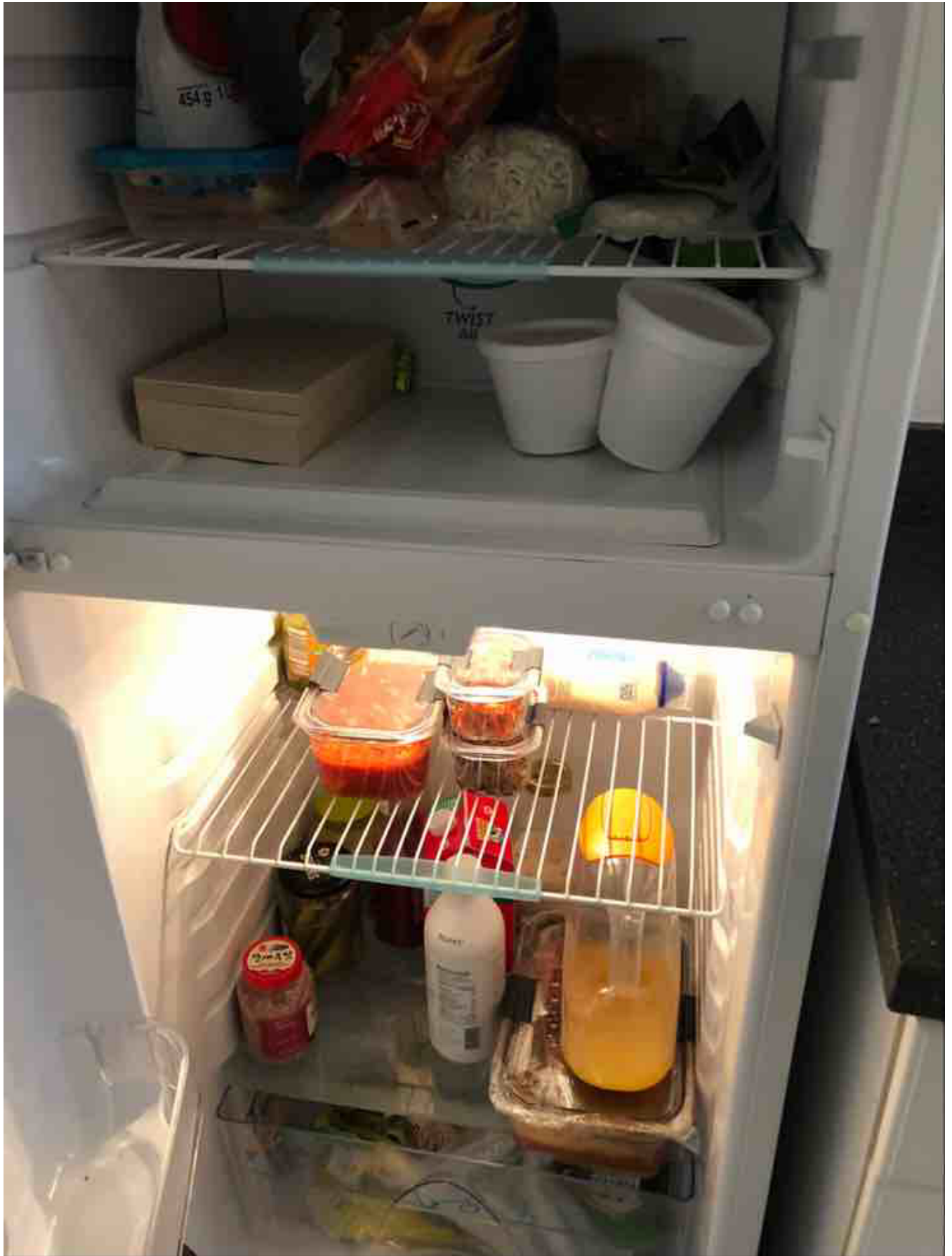
No personal items: Not Ok