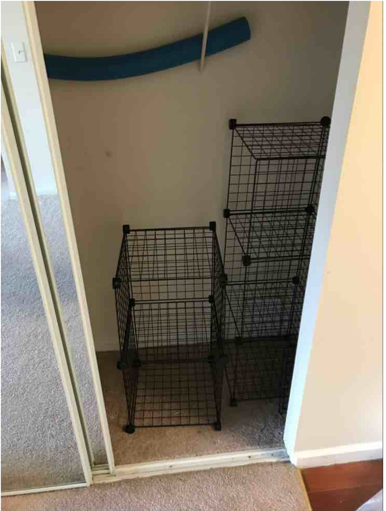
Other: Not Ok