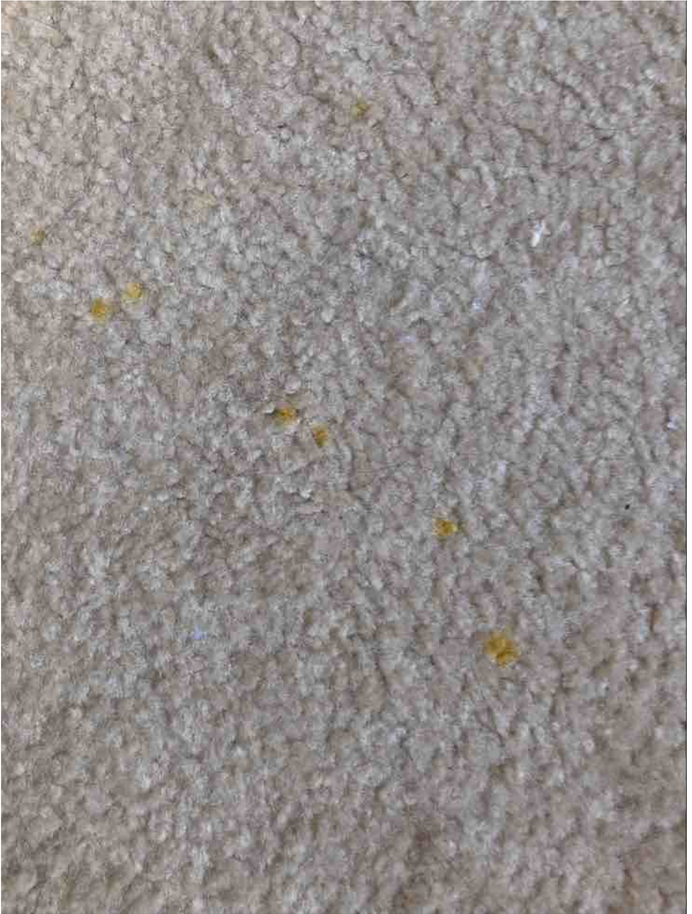
Replace Carpet 2 Bedroom: Not Ok