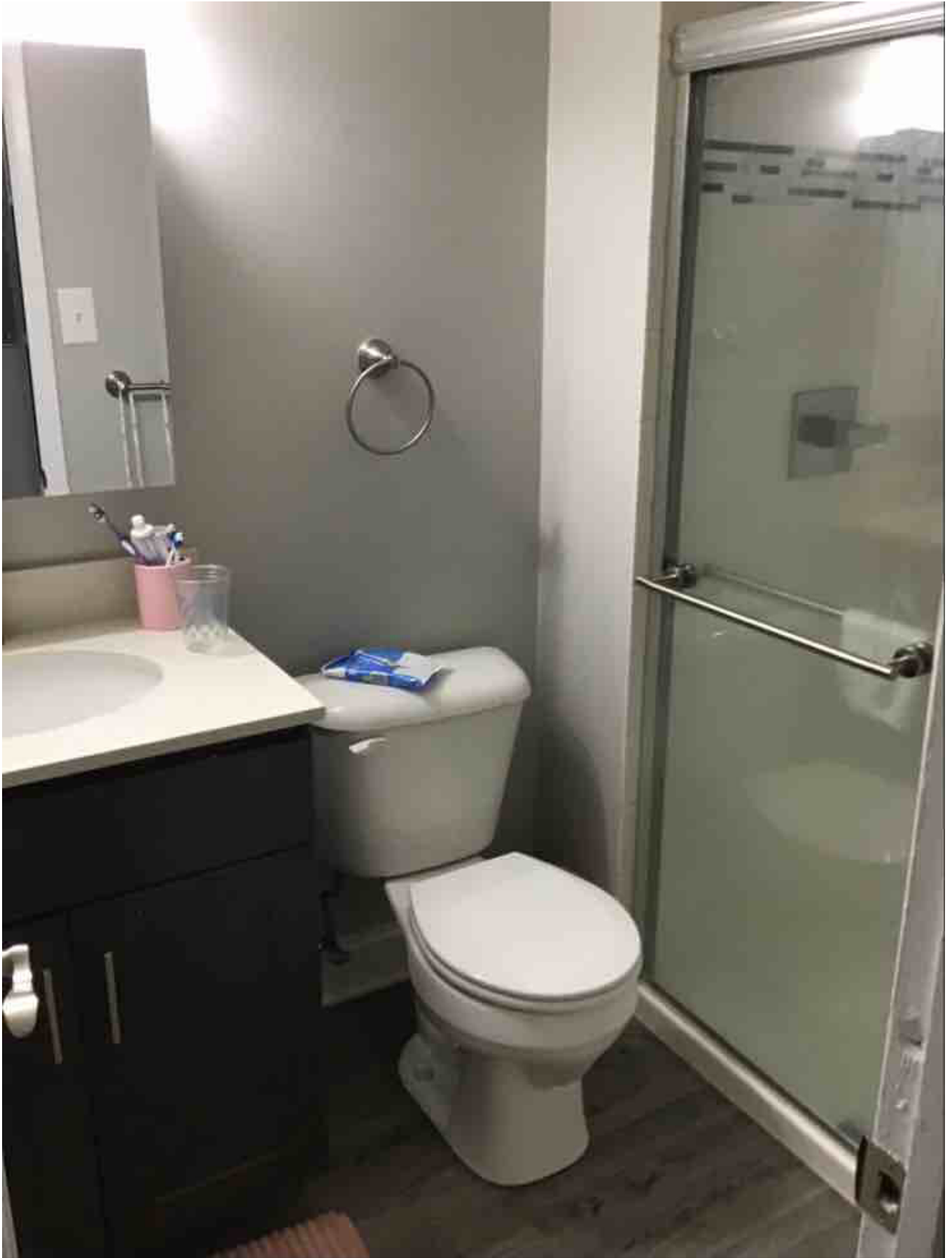
Amenity Name: 2bd Up Kit Amenity Rate: 150.00 Amenity Note: