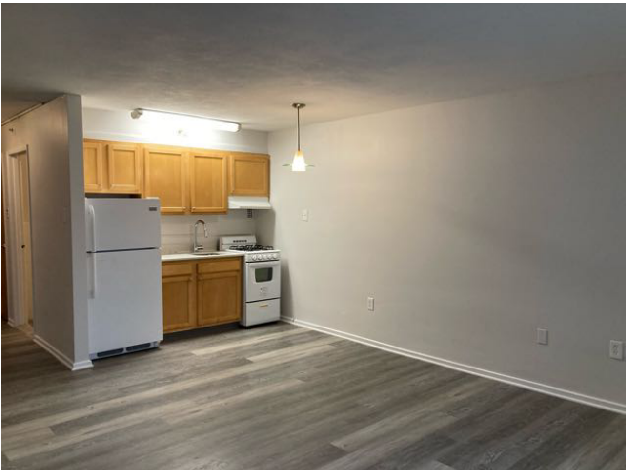
Amenity Name: Plank Flooring