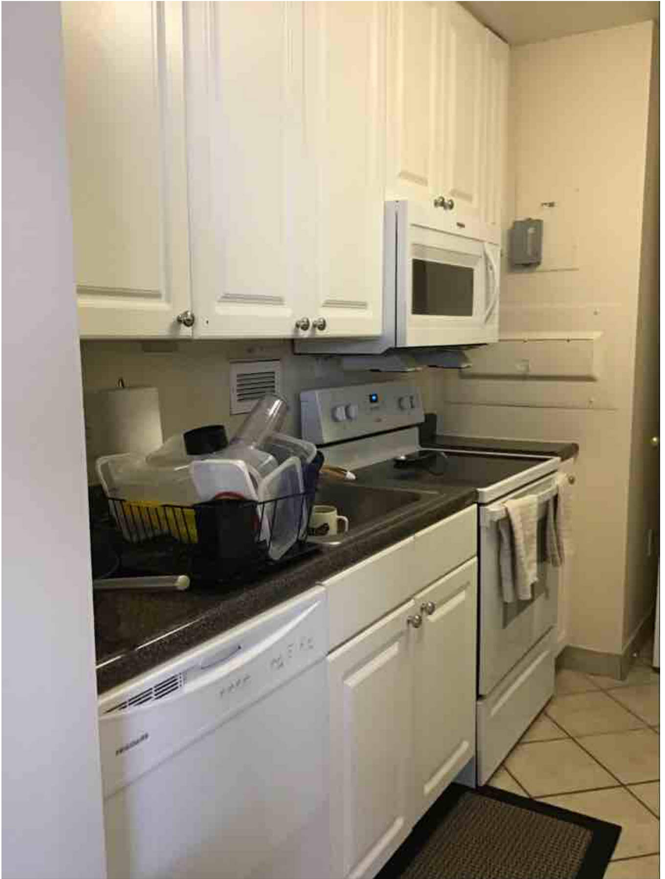
Amenity Name: BathRHB Amenity Rate: 25 Amenity Note: