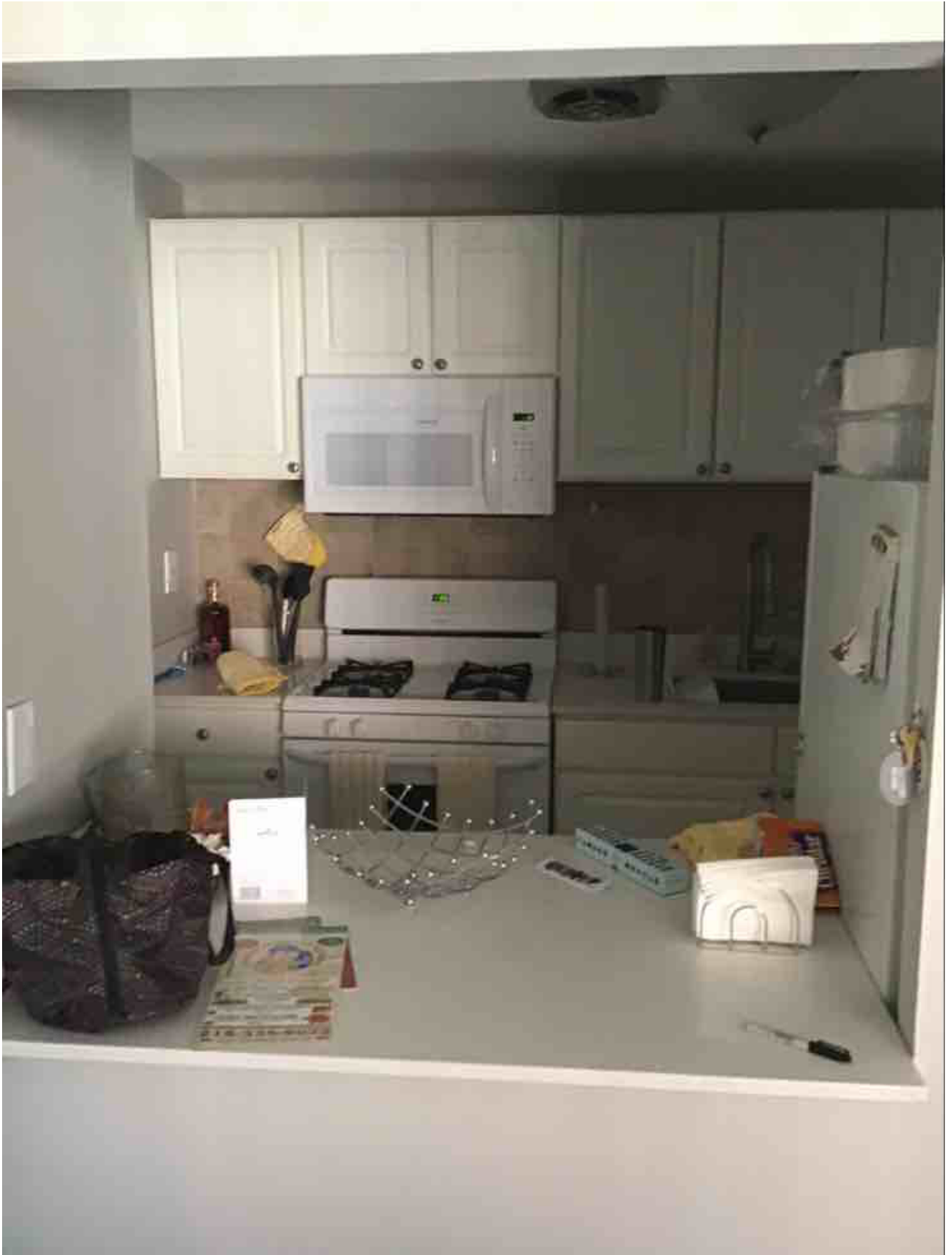
Amenity Name: Base Rent Amenity Rate: 960.00 Amenity Note: