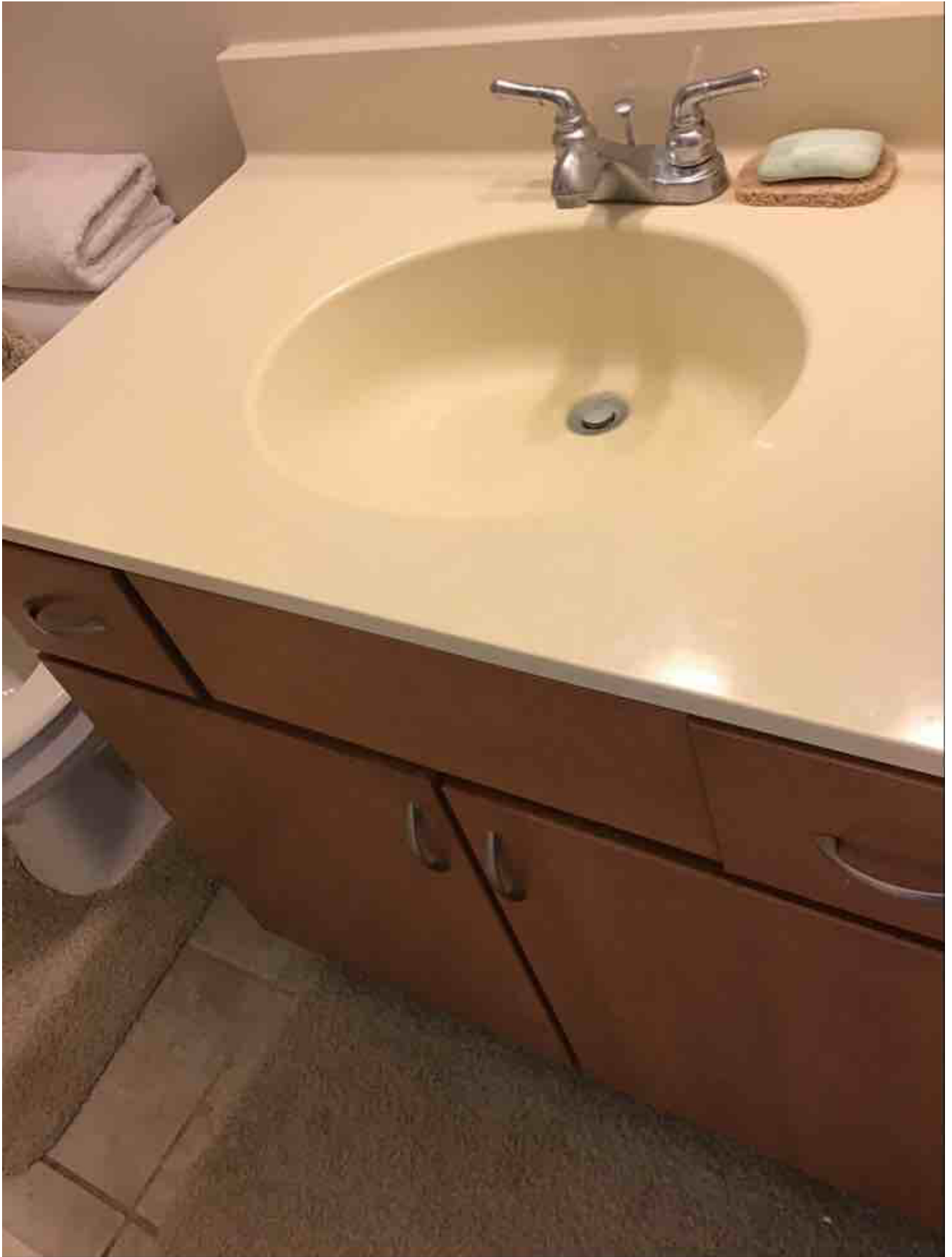
Amenity Name: BathRHB Amenity Rate: 25 Amenity Note: