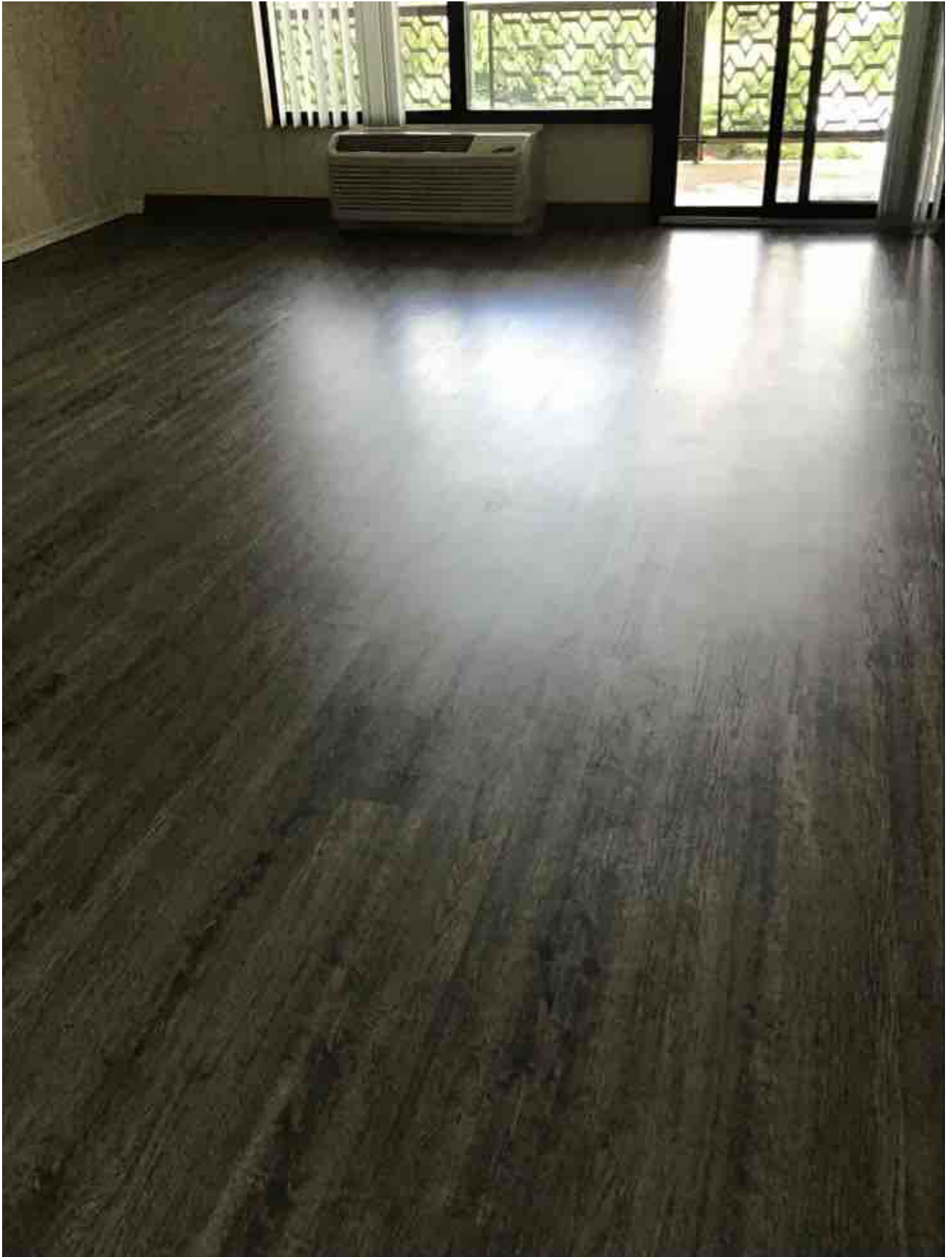
Amenity Name: Home Office Amenity Rate: 150 Amenity Note: