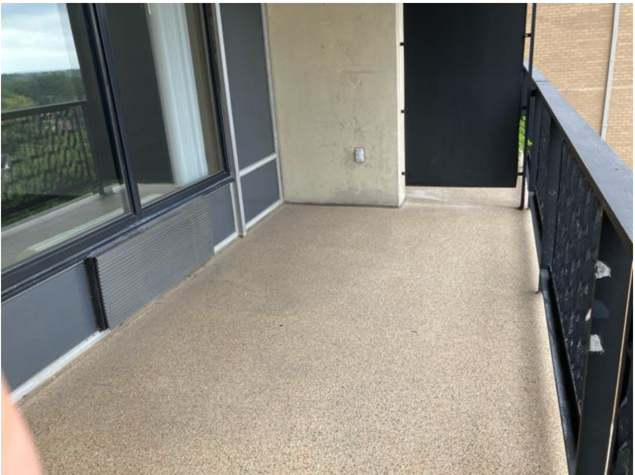
Amenity Name: Plank Floor 1bd