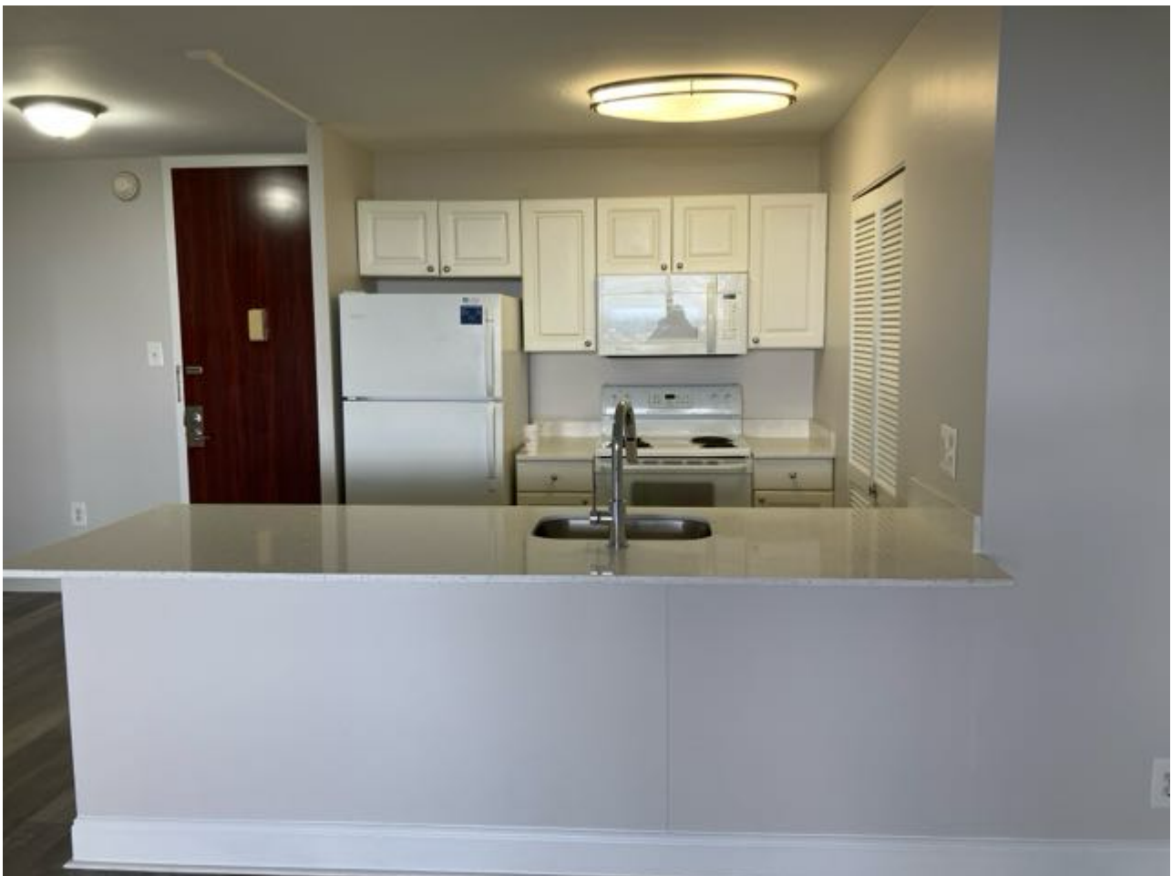
Amenity Name: View-Pos1