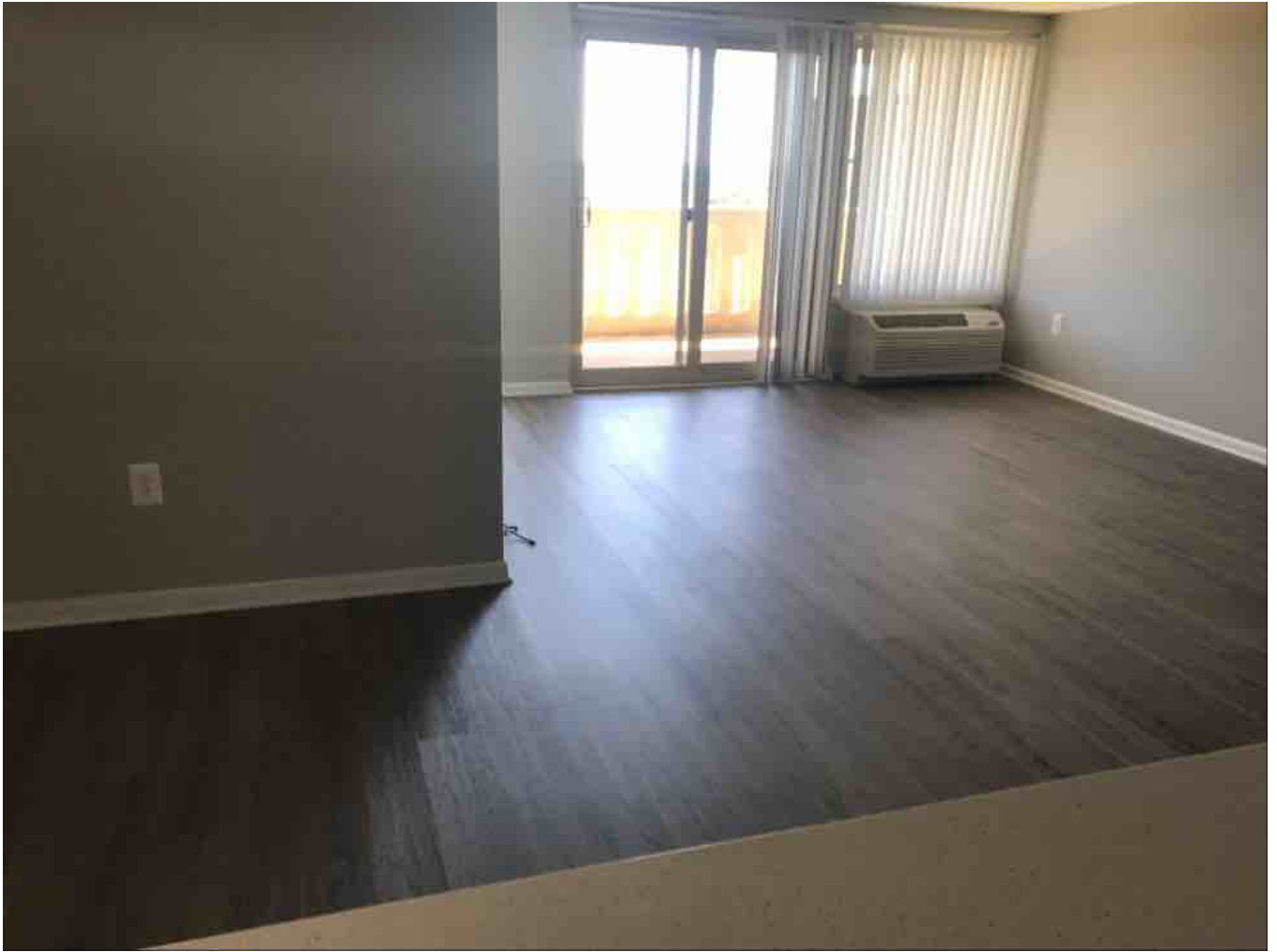
Amenity Name: Countertop Amenity Rate: 35 Amenity Note: