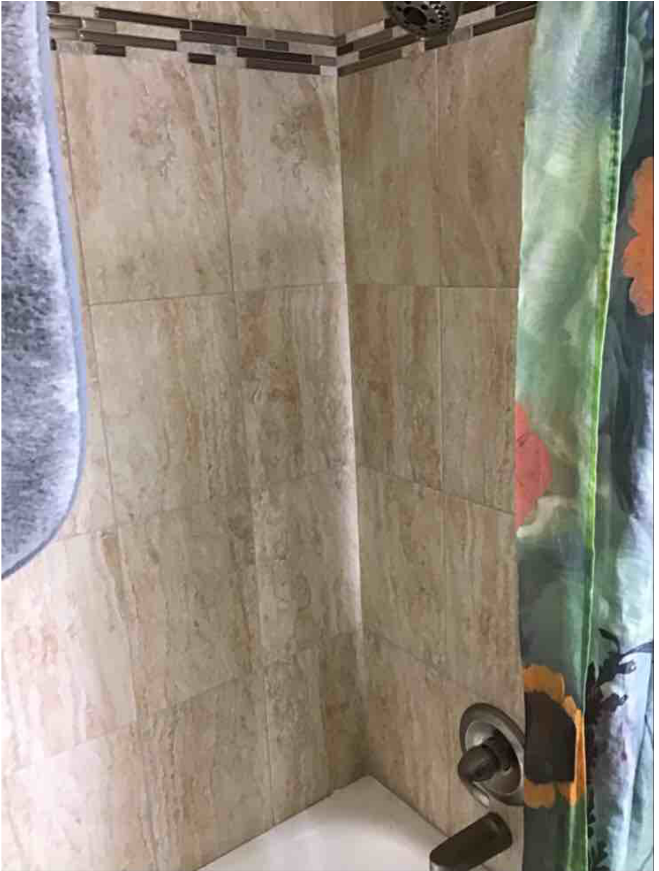
Amenity Name: Quartz Countertops Amenity Rate: 50 Amenity Note: