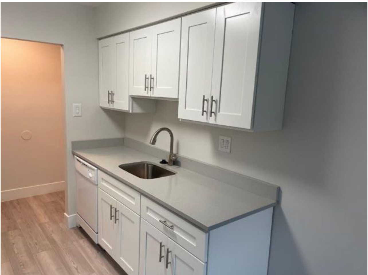
Amenity Name: Lindy Kitchen