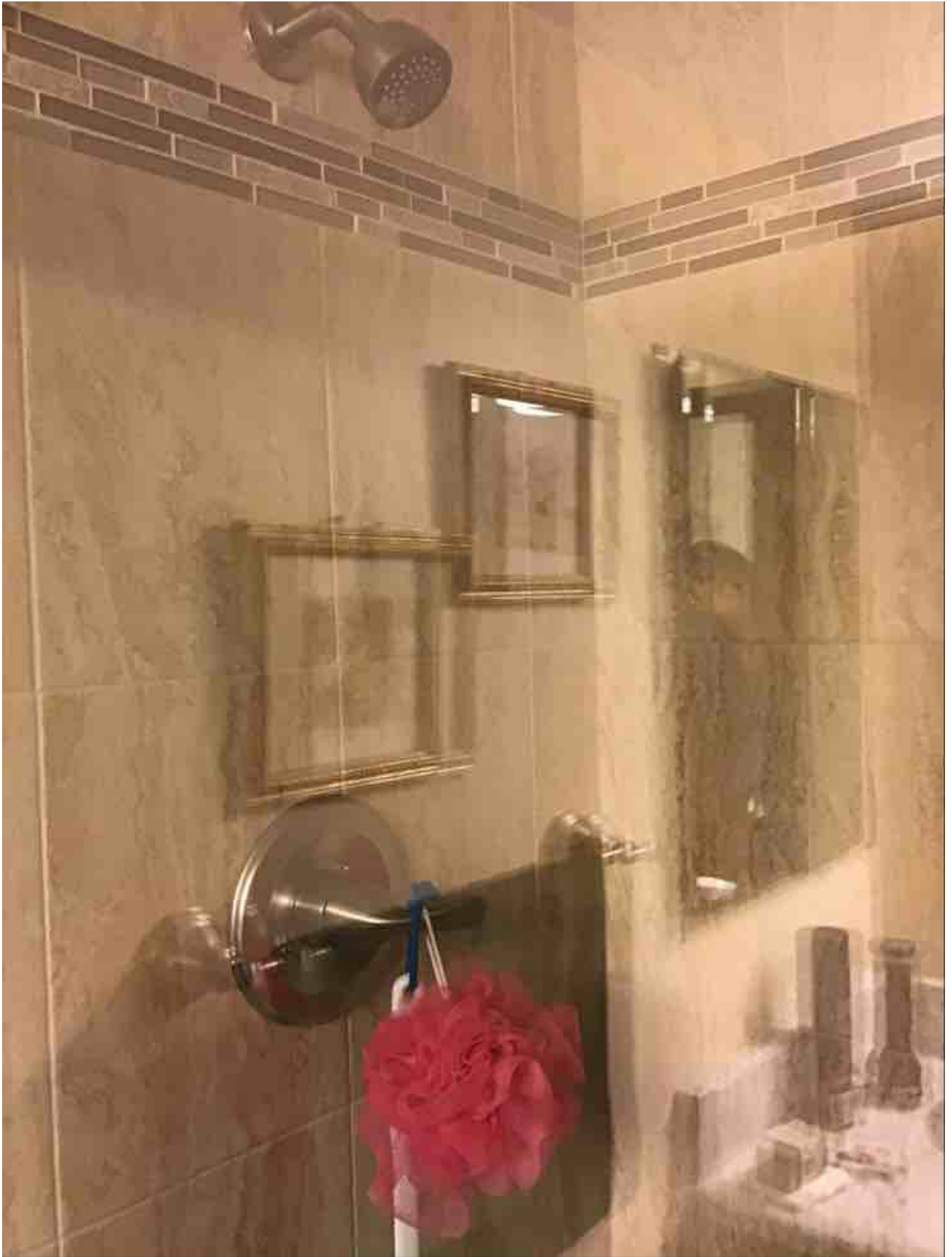
Amenity Name: Quartz Countertops Amenity Rate: 50 Amenity Note: