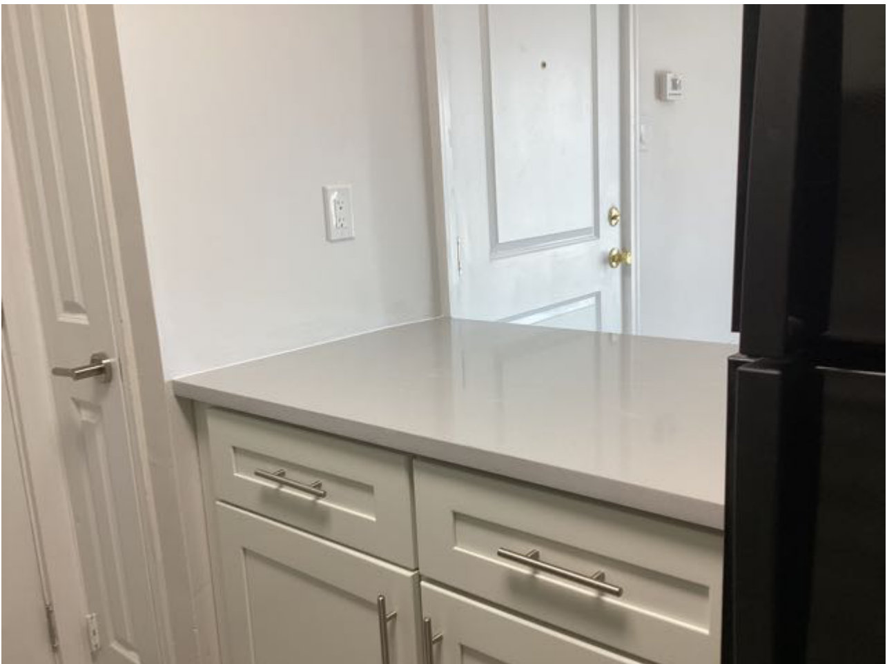
Amenity Name: Gray Kitchen