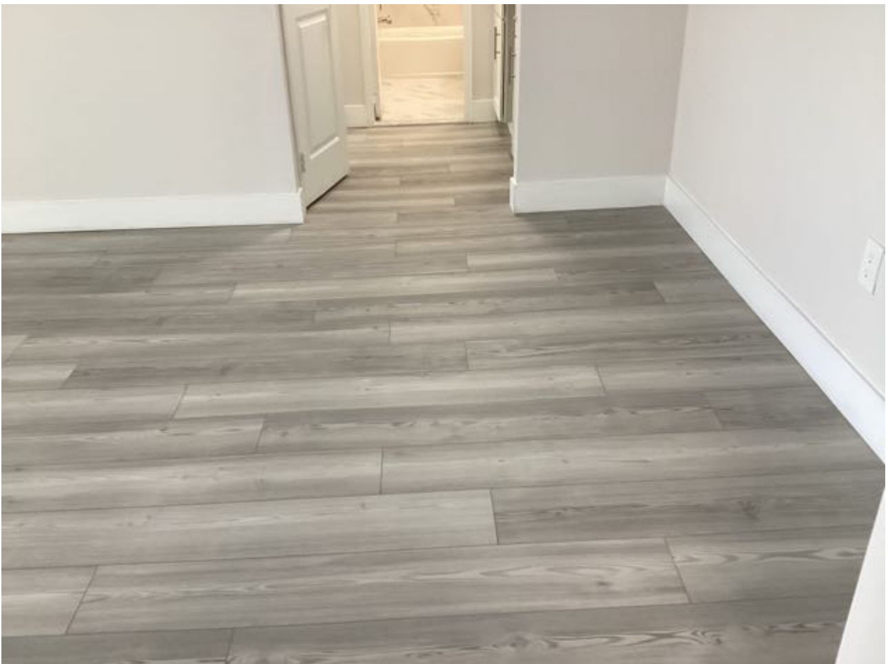
Amenity Name: Base Rent