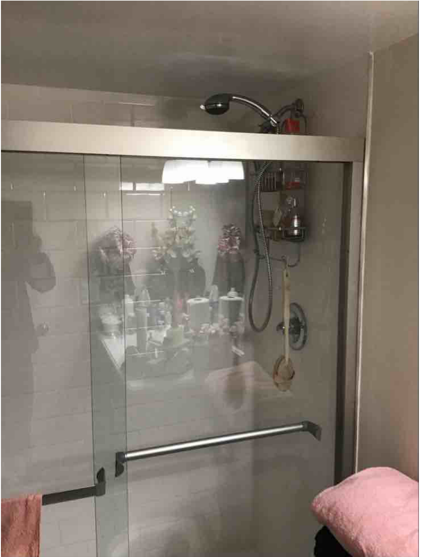
Amenity Name: Updated Tub