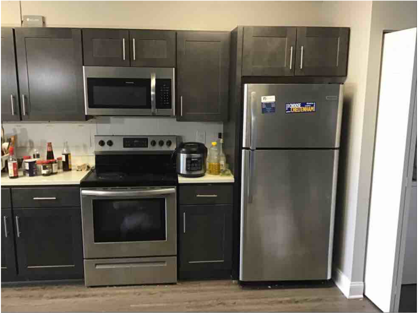
Amenity Name: Countertop Amenity Rate: 35 Amenity Note: