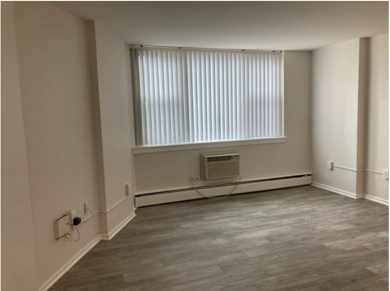
Amenity Name: Base Rent