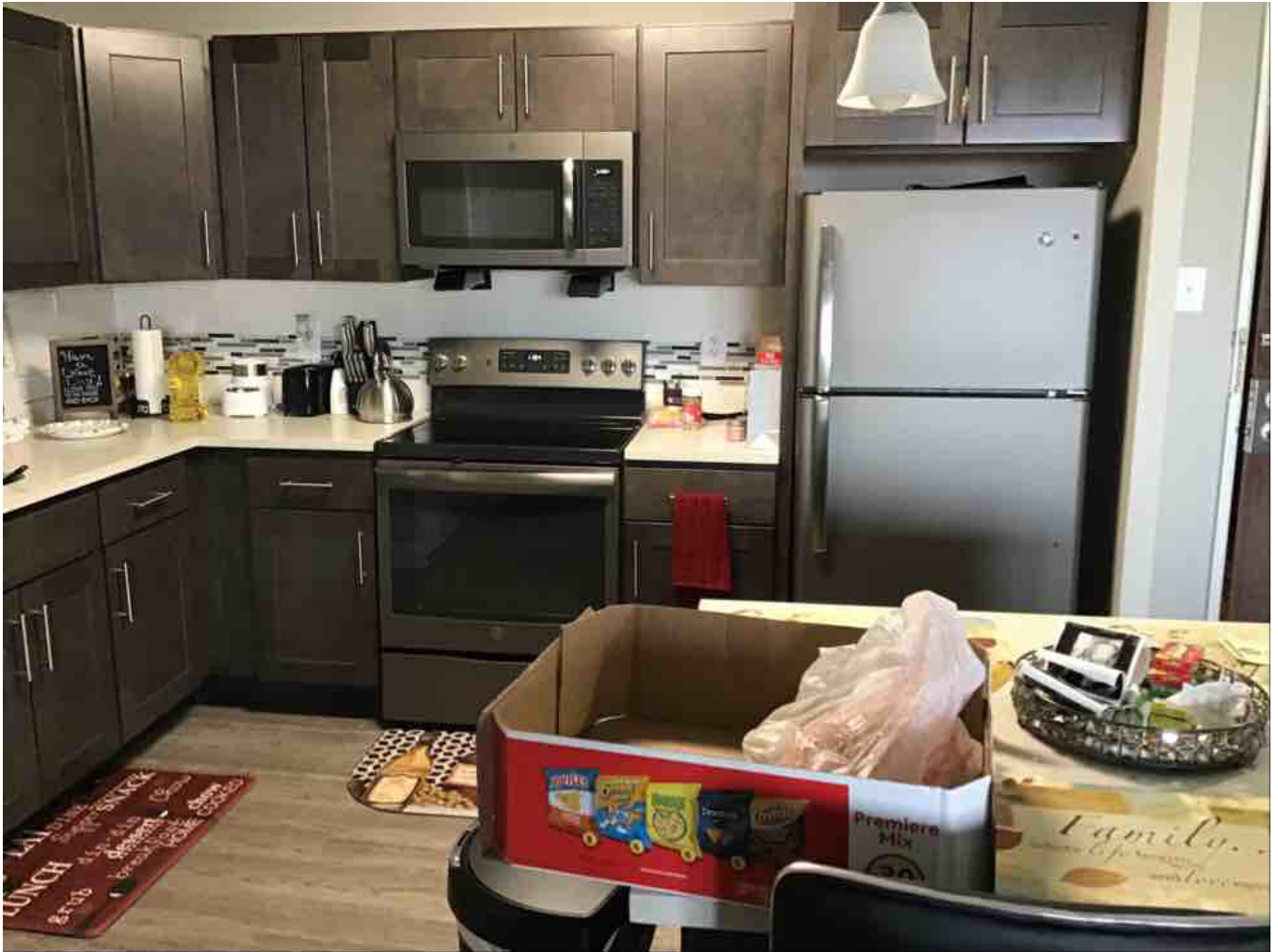
Amenity Name: Plank Floor1 Amenity Rate: 50 Amenity Note: